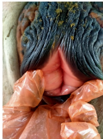
Swelling & reddening of vulva