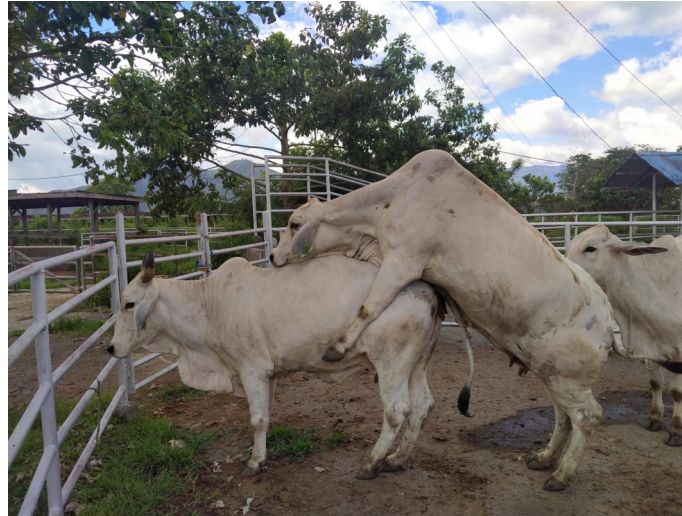
Standing still when mounted by other (standing heat)

You may see one or all of these heat signs at the same time: