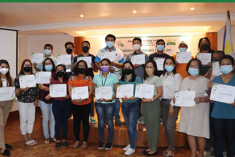
Twenty participants completed and received their certificates of completion during the Training of Trainers (TOT) on Digital Farmers Program (DFP) in Balanghais Hotel, Butuan City on April 20-22, 2022.

BUTUAN CITY - Twenty participants completed and received their certificates of completion during the Training of Trainers (TOT) on Digital Farmers Program (DFP). This was conducted by the Agricultural Training Institute-Regional Training Center (ATI-RTC) 13 in Balanghais Hotel, Butuan City on April 20-22, 2022.