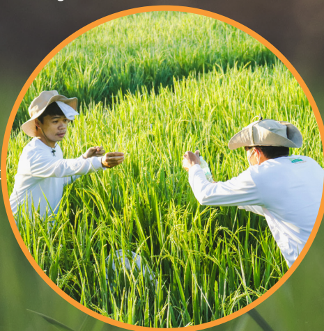
Participants identify and collect insect pests and disease specimens during the field activities of the Refresher Course on Rice Pests and Diseases Management.