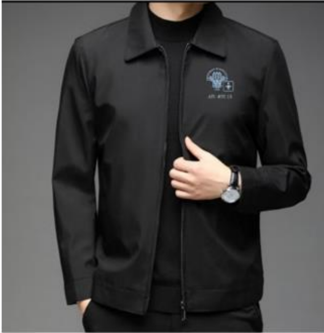
OA Corporate Jacket