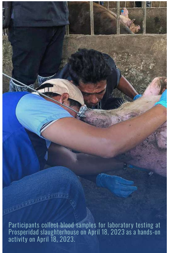
Participants collect blood samples for laboratory testing at Prosperidad slaughterhouse on April 18, 2023 as a hands-on activity on April 18, 2023.