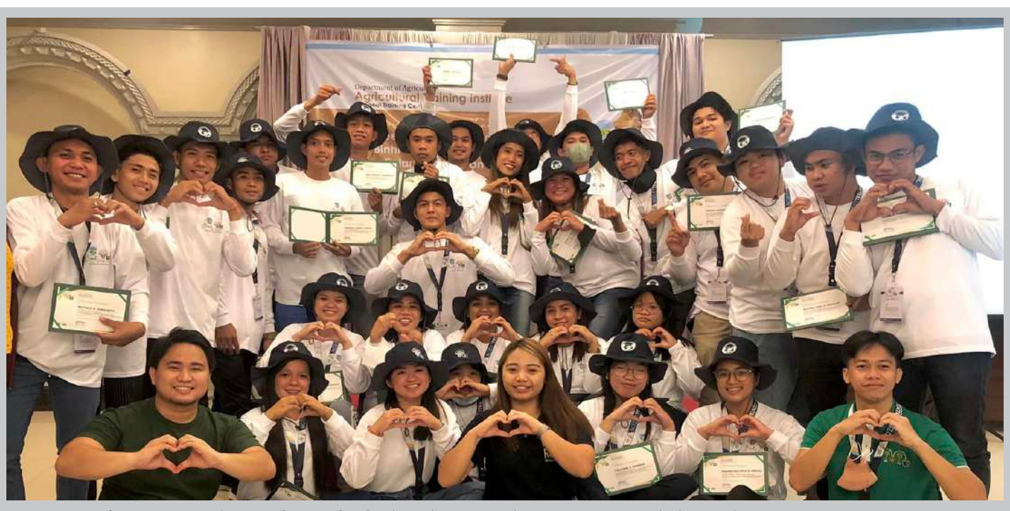
Bataan young farmers receive their certificates after finishing the provincial TOT on Free-range Chicken Production.

The participants are expected to share their learnings to their fellow club members and create mushroom-based products to provide income to their respective groups. (DMLapuz)