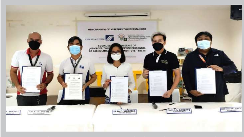
Representatives from ATI-CL and SSS sign the MOU for the social security coverage of JO and COS workers of ATI-CL

Allowing the staff to raise their concerns, the SSS addressed all the questions with special cases such as pregnancy benefits and disrupted contribution.