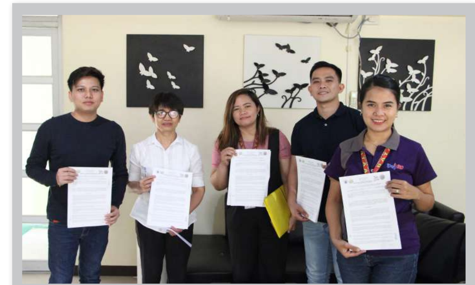
ATI-CL and Magsaysay National High School representatives ink MOA for Senior High School Work Immersion.

The agreement outlines the terms of the work immersion program, which will run for a period of two weeks. The program will provide senior high school