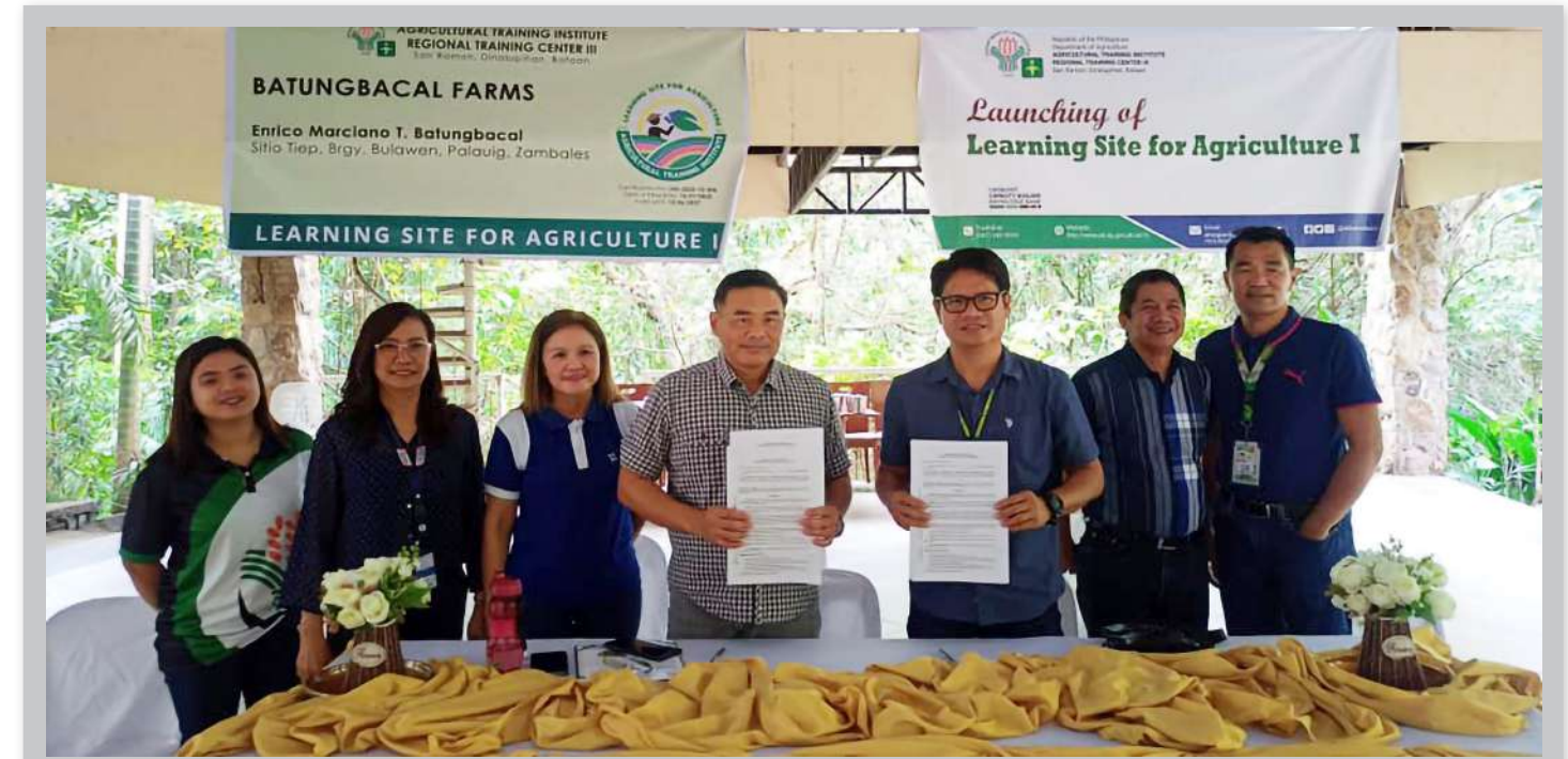
ATI - Central Luzon certify the Batungbacal Farms as one of the Learning Sites for Agriculture in the region.

The event was capped off with Palaring Lahi or team-building activities participated by ATI-CL staff. Since 2019, the anniversary celebration of ATI was brought to the centers from the Central Office so that the Center's staff and stakeholders can take part in the event. (EDLañada)