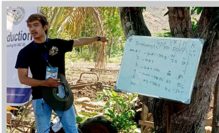
Season-long Training of Trainers on ICM participant discusses topics about corn production.