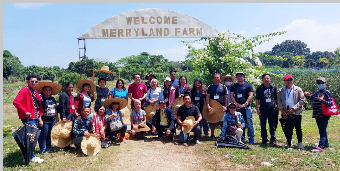
The participants visit Merryland Integrated Farm and Training Center Inc. in Pulilan Bulacan as a benchmark activity of the training.