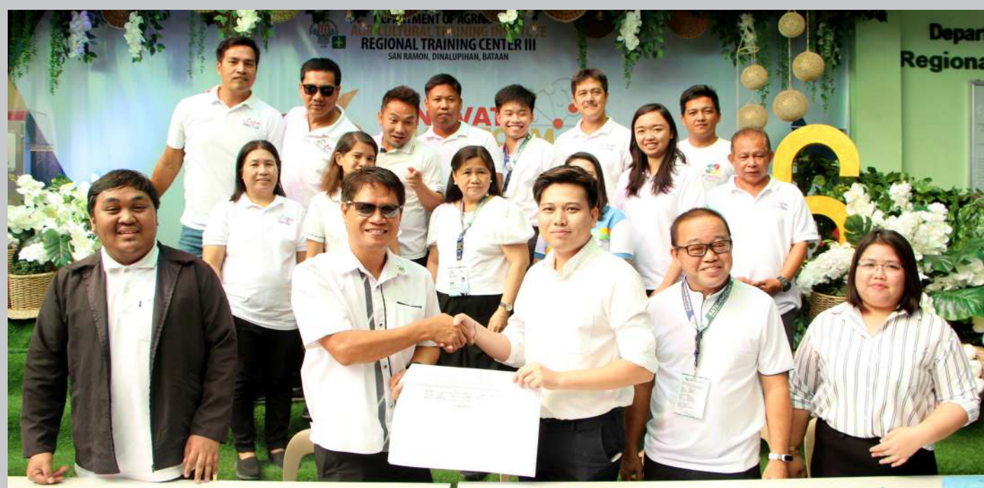
The Administrative and Finance Unit signify their commitment to the plans and programs of ATI-CL this year.