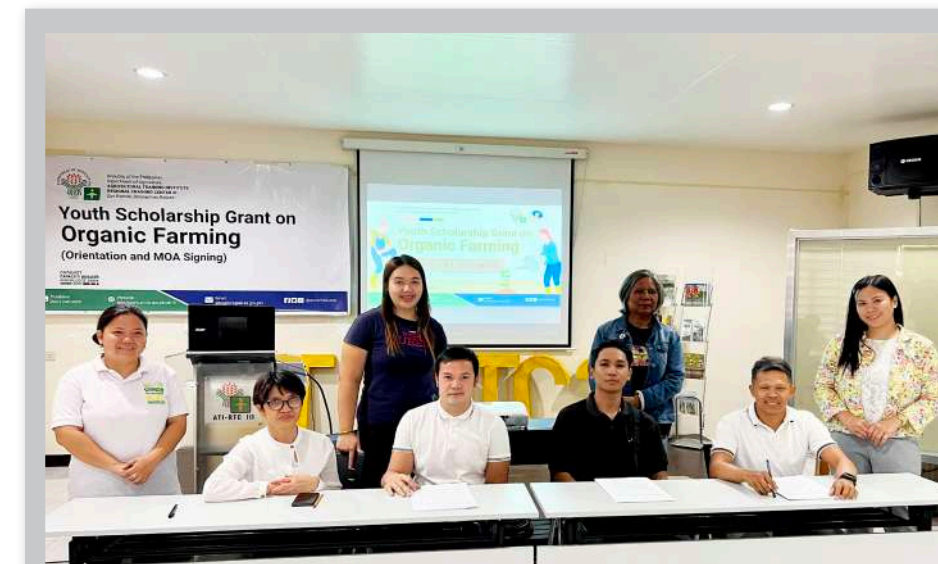
Representatives from ATI-CL and Bonagua Integrated Farm together with the scholars sign the MOA for the Youth Scholarship Grant on Organic Farming.

In addition, the farms that will train the young farmers for the