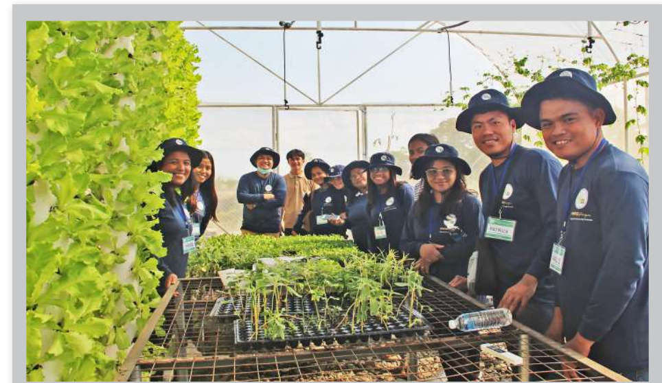
The agricultural Extension Workers from Tarlac and Nueva Ecija learn about hydroponics during the Training of Trainers on Lowland Vegetable Production in CLSU

The participants also had a chance to visit the technology demonstration farm of Mikai Agri Trading, showcasing tower gardens and hydroponically grown high-value crops. They engaged in hands-on activities