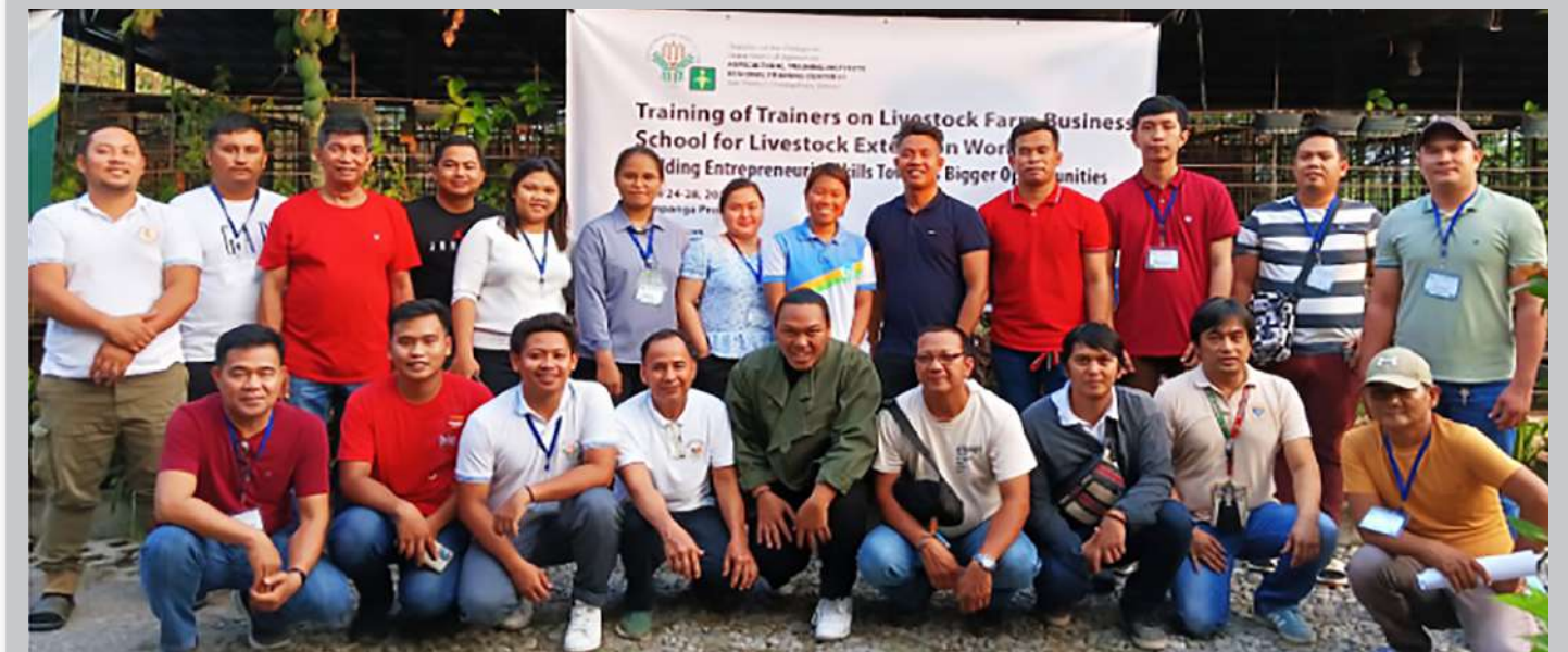
Agricultural extension workers from Bulacan participate in Training of Trainers on Livestock Farm Business School in Bacolor, Pampanga

After the briefing, RCM recommendations were given to the participants to guide them in the next cropping season.