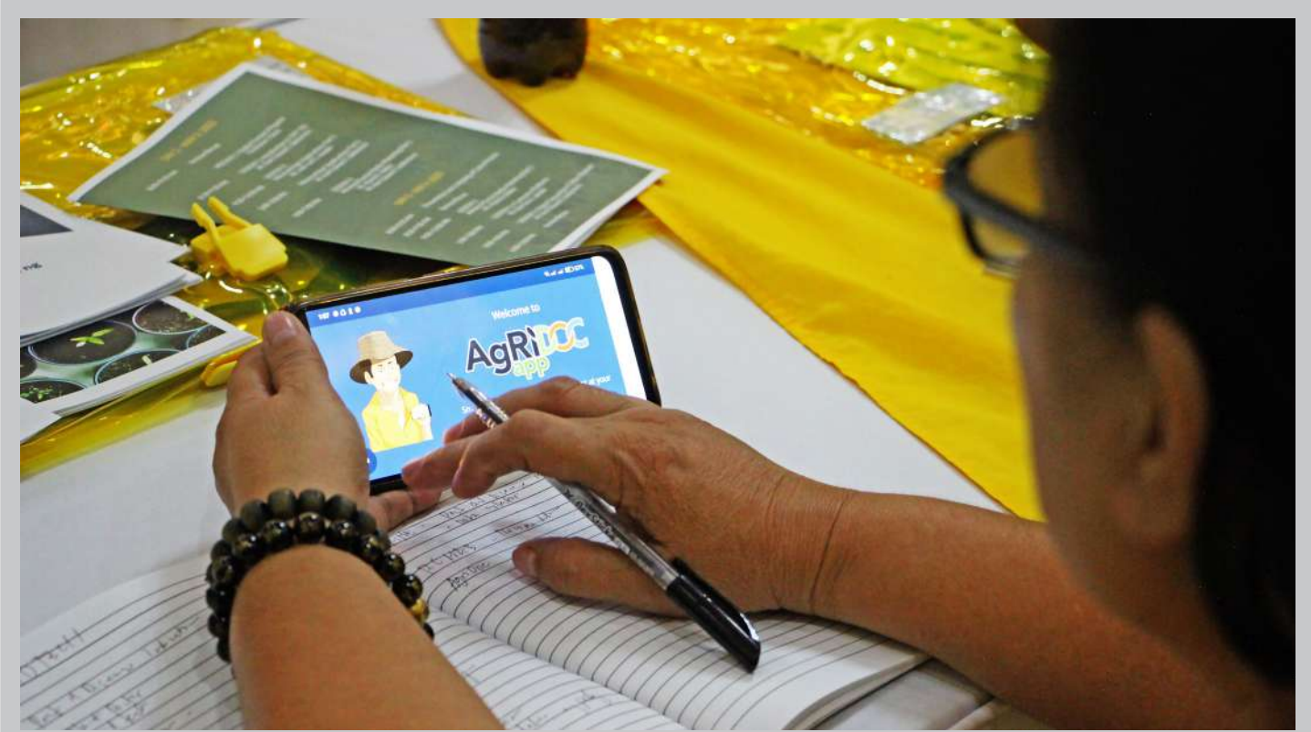
A participant of Digital Farmers Program explores the AgRIDOC app during the said training in Tarlac.

About BUSLO: Buslo symbolizes the preservation of bountiful harvest in Central Luzon being the rice granary and vegetable basket of the Philippines. Like the humble vessel present in every Filipino, the publication aims to store and bring relevant and timely news to every farmer, fisherfolk and extension workers in the region.