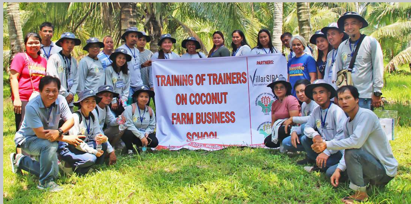
Agricultural extension workers and farmer-leaders from Aurora and Bataan attend the Training of Trainers on Coconut Farm Business School