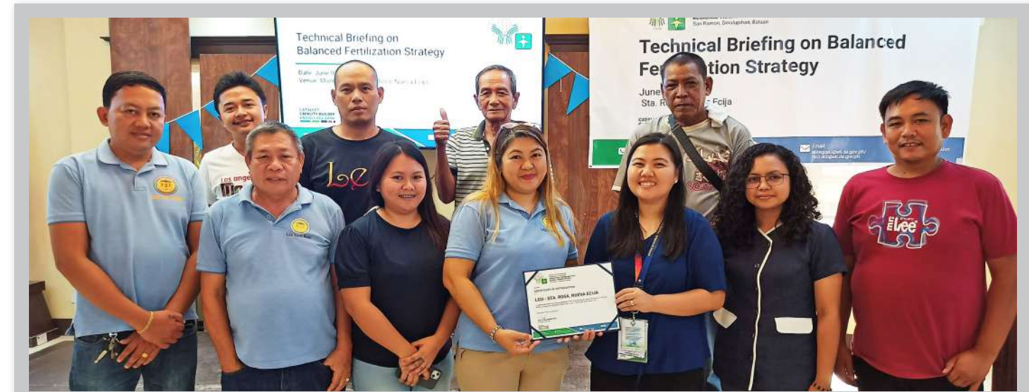
The farmers in Sta. Rosa, Nueva Ecija participate in a technical briefing on balanced fertilization strategies in June this year

The participants received assorted seeds, garden tools and materials, free-range chicken, and electric knapsack sprayer. (DMLapuz)