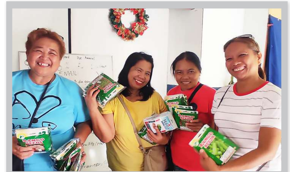
The participants of the 1st batch of Training Course on Production Technology for RBOs receive their extension support as part of the said training