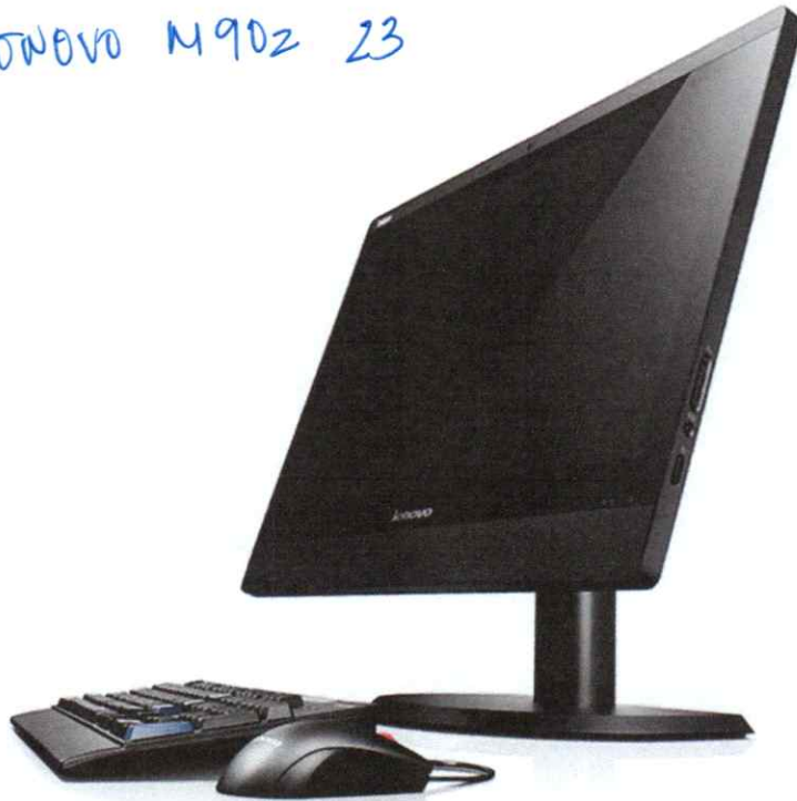
Desktop with mouse and keyboard