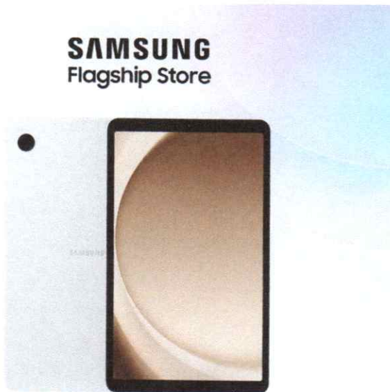
Galaxy Tab A9 LTE