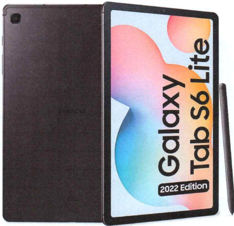
Samsung Tab s6 lite