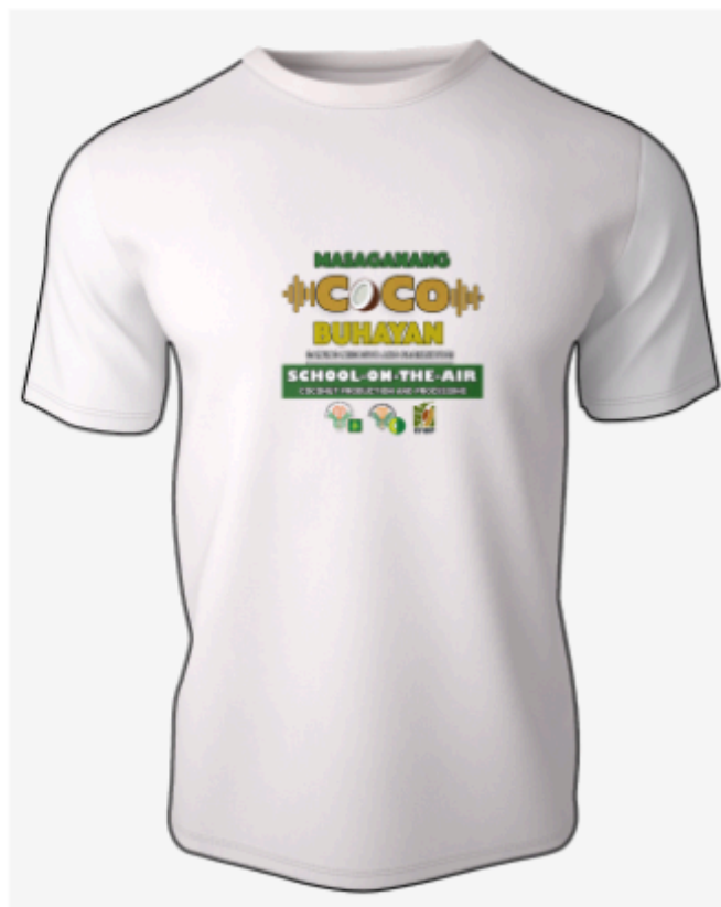
FOR FARMERS 580 pcs (initial)