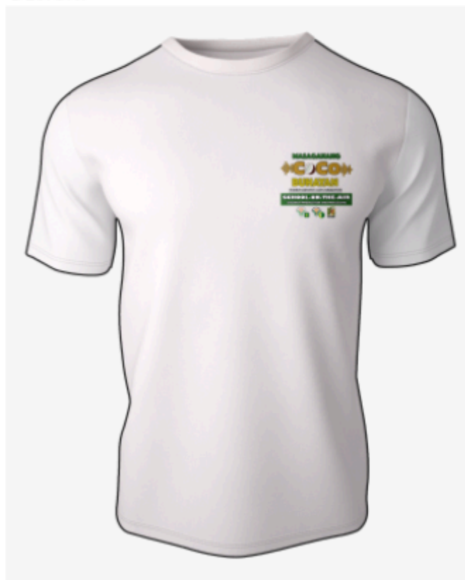
FOR COORDINATORS 70 pcs (initial)