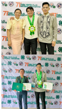
NATIONAL URBAN AND PERI-URBAN AGRICULTURE PROGRAM