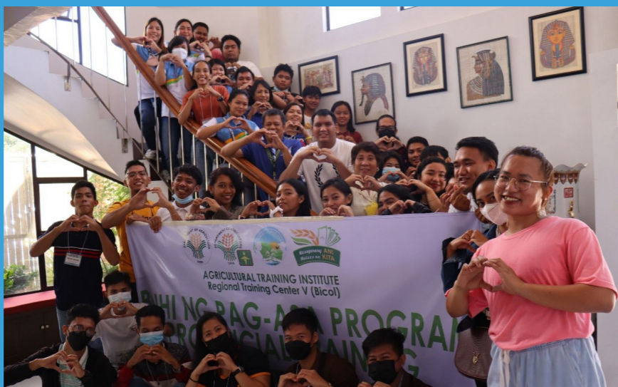
The participants with officers and staff of ATI Bicol, OSGP and Provincial Agriculture Office strike a vibrant smile on their group photo.

DAET, Camarines Norte – The Department of Agriculture’s Agricultural Training Institute Regional Training Center V (DA-ATI Bicol), through the collaborative effort of the Office of Senator Grace Poe (OSGP), has conducted the Provincial Training of Trainers (TOT) for Binhi ng Pag Asa Program held on July 19-21, 2022 at Casa Marie Hotel, Bagasbas, Daet, Camarines Norte.