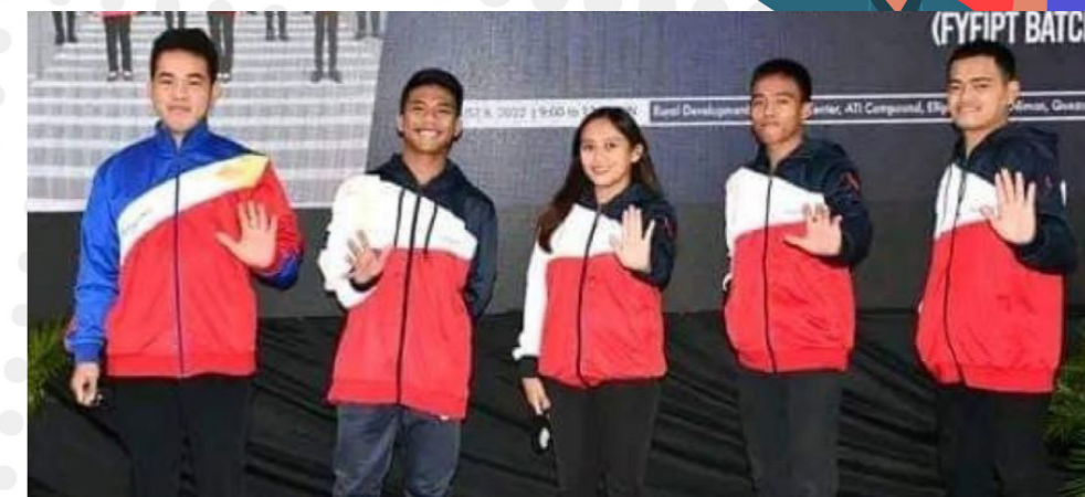
Ang limang miyembro ng 4-H na naging bahagi ng Filipino Young Farmers Internship Program in Taiwan.

Ang programa ay kasunduan sa pagitan ng Agricultural Training Institute Central Office, Manila Economic and Cultural Office (MECO) at Taipei Economic and Cultural Office in the Philippines (TECO) para sa pagpapadala ng mga kwalipikadong kabataang Pil-