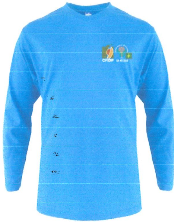
ADVOCACY LONGSLEEVES (With Printed logo of CFIDP and ATI-Digital Print)