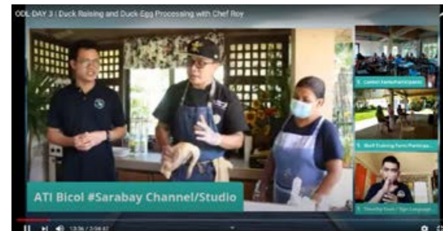
Going beyond the pilot phase, the ODL on duck raising and duck egg processing is expanding possibilities of the new modality.