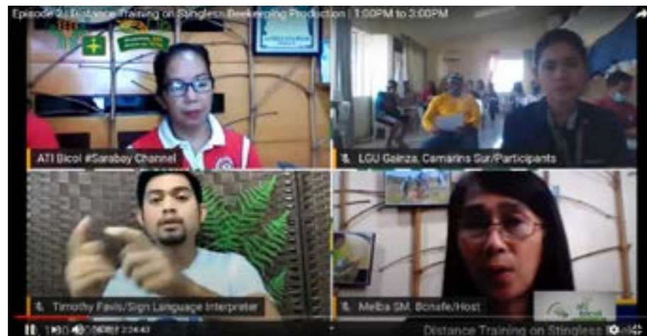
The Blended Training on Stingless Beekeeping produced 16 graduates who successfully completed the course requirements. Each graduate received a stingless bee colony from ATI as their starter kit.

Conducted collaboratively with the Municipal Agriculture Office, the face-to-face training produced 21 attendees