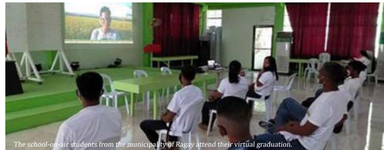
The school-on-air students from the municipality of Ragay attend their virtual graduation.

CAMARINES SUR – Five hundred (500) registered rice farmers from the province of Camarines Sur successfully completed the training course on ATIng Kaugnay School on-the-Air (SOA) Program on the Production of High-Quality Inbred Rice and Seeds and Farm mechanization under the Rice Competitiveness Enhancement Fund (RCEF) Program.