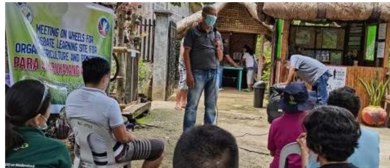
The mobile meeting visited farms in various municipalities for the participants to share from one another’s learning experiences.

MASBATE City – Once more, Masbate is blazing the trail. The provincial local government unit’ (LGU) through the Provincial Agriculture Office organized a mobile seminar attended by the Learning Sites for Agriculture (LSA) cooperators and organic farming practitioners.