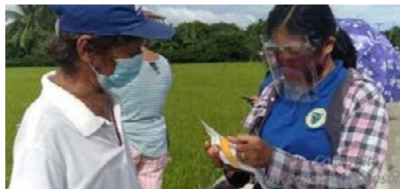
The participant measures farm using a geotagging device and interviews a farmer as part of their training on Rice Crop Manager

participant registered a farm, measured this farm using a GPS device or geotagging, and provided an RCM-generated fertilizer recommendation.