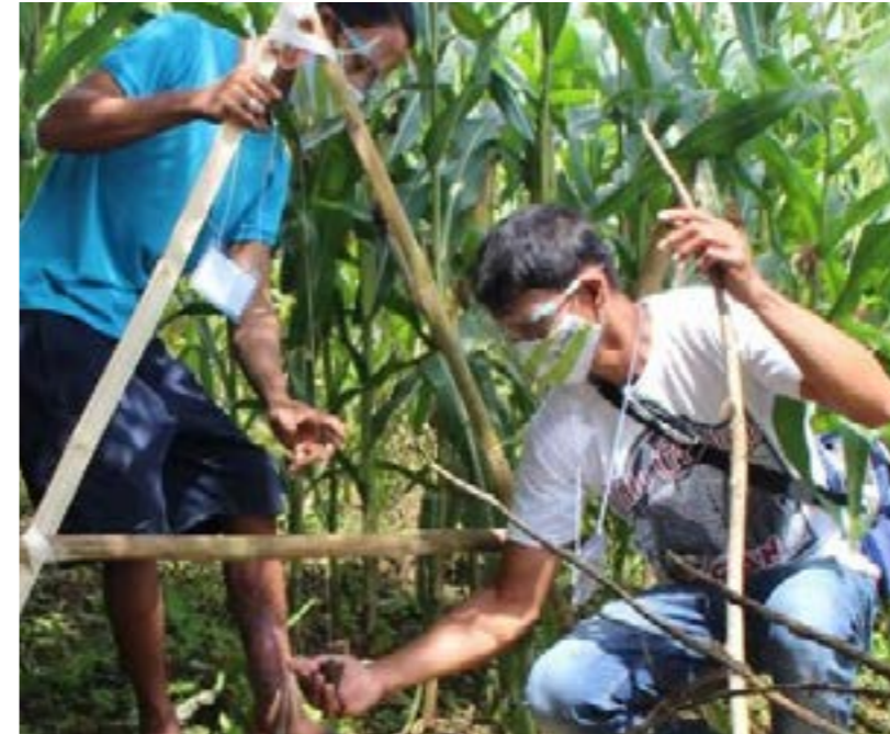
Trainees in Sagrada, Iriga City learn to make and use the A-frame, a simple but effective tool used in contour farming and sloping agricultural land technology or SALT.

PILI, Camarines Sur -- Corn farming is a profitable source of income. This is possible with the introduction of innovative corn production technologies in recent years. Corn is also a nutritious alternative to rice as food for Filipino families.