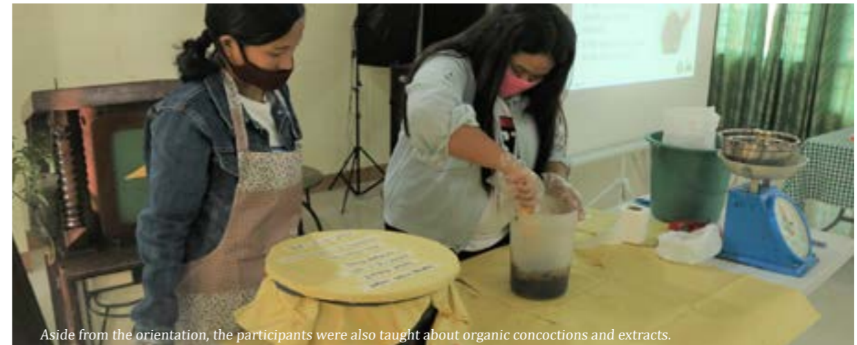
Aside from the orientation, the participants were also taught about organic concoctions and extracts.

Printed in the Philippines Copyright 2020. All Rights Reserved