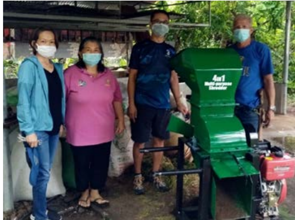
Baluzo Farm evolved into an SPA, proving itself capable of doing frontline extension services. During this time of pandemic, the SPA serves as community-based channel of training and extension services of ATI.