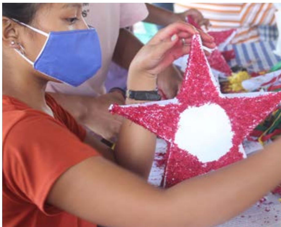
A participant shows her star-designed corn-based product.