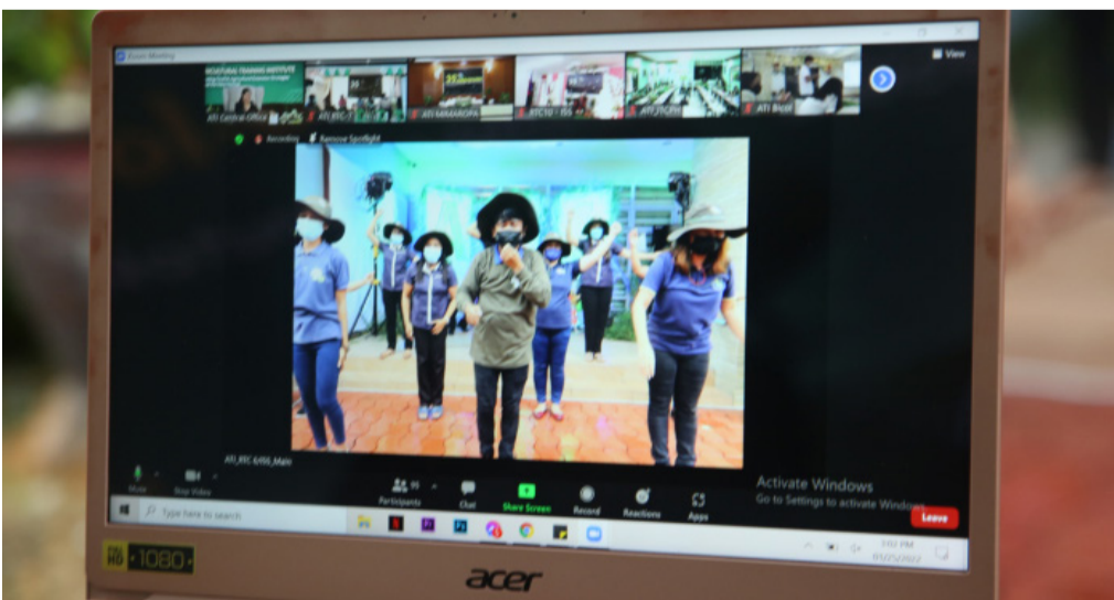
All anniversary ceremonies were conducted and attended virtually in compliance with health and safety standards.