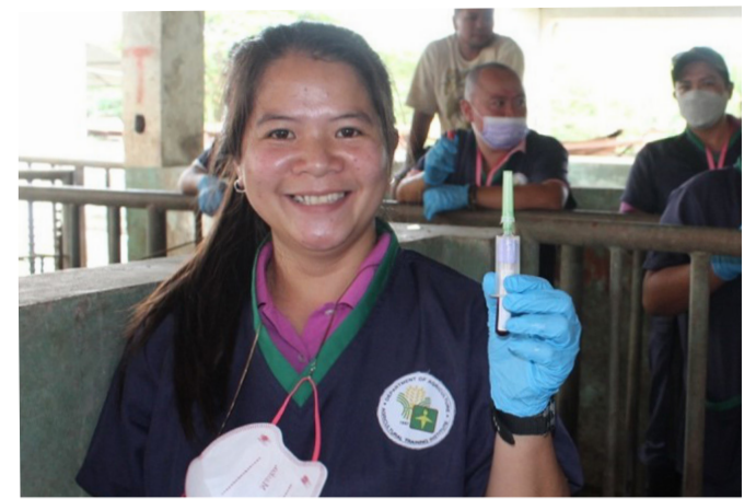
The trainee shows the blood samples she successfully collected from a pig, as one of the course requirements.

ILOILO, Western Visayas – Sixty-four selected livestock technicians contributed to sustain the “ASF-free Western Visayas” by attending the Training on Specimen Collection for Barangay Biosecurity Officers (BBOs) in the five districts of Iloilo Province this March 2022.