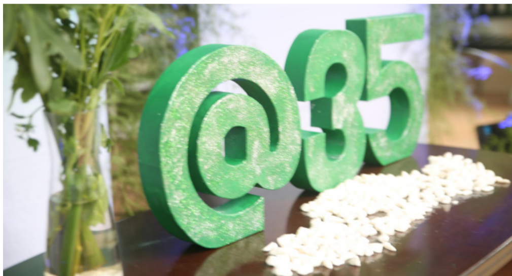
The theme, “Innovating OneDA Agricultural Extension Strategies Beyond the New Normal” marks ATI’s 35th founding anniversary.