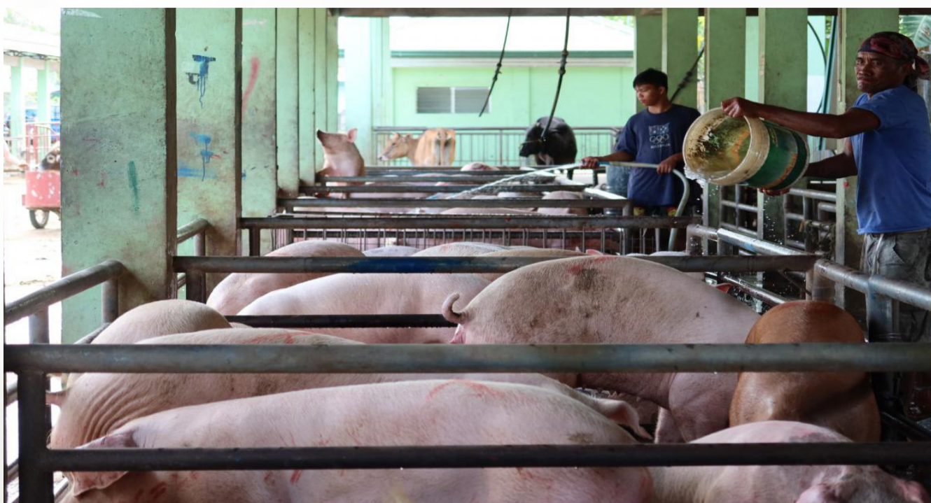
Consolidated hogs from various barangays in Sibalom and nearby municipalities are being prepared for shipment to Metro Manila.

SILPRA feeds are sold at PHP1,380 for a 50-kilo bag of grower feed while a bag of 50-kilo starter feed is sold at PHP1,430. Their product is cheaper compared with those being sold in the commercial market. Commercially, a bag of the 50-kilo grower feeds is available at PHP1,490 while the starter feeds is at PHP1,675. Using SILPRA feeds helps hog raisers save a lot of money and gain more profit in their backyard project. Feed products of SILPRA are available not only for its members but are also offered for other interesting livestock and poultry raisers in the province.