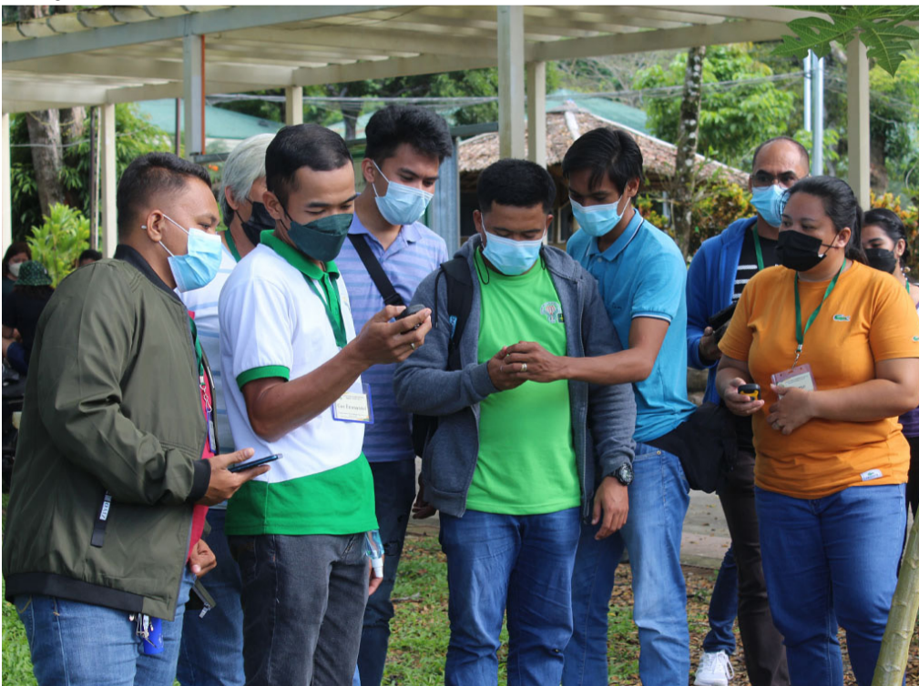
Participants perform a demonstration of measuring farm lot using GPS, a required data in registering farmers in the RCMAS App.

RCMAS 4.0 is readily available to download on Google Playstore.