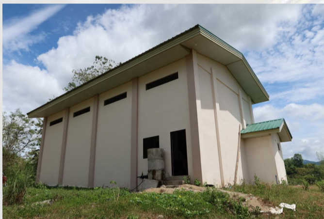
SILPRA's PHP7.5 million income-generating feed mill facility provides a livelihood for its members and a cheaper feeds option for the swine raisers in the community.

Aside from the consolidation of livestock, SILPRA also operates the feed mill facility that produces feeds for livestock and poultry animals. A PHP7.5-million feed mill facility was acquired by the association from the Department of Agriculture-Bureau of Animal Industry (DA-BAI) and turned into an income-generating project.