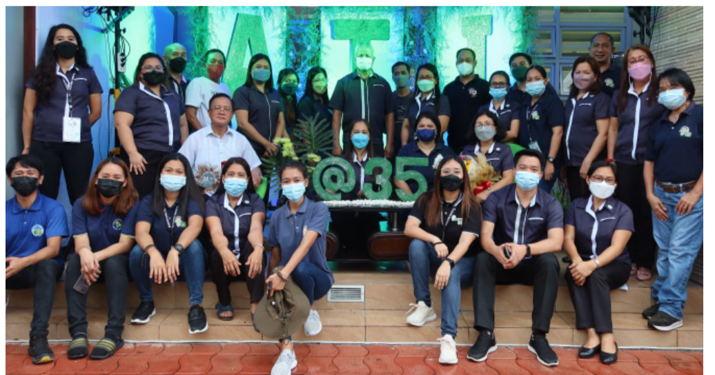
Camaraderie and commitment: The ATI Region 6 team continues to work hand-in-hand to deliver excellent extension services beyond boundaries.