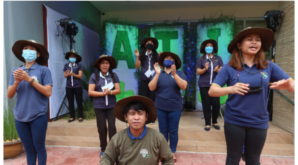
Special performances in the form of cheer and dance numbers showcased the culture and individuality of each region.