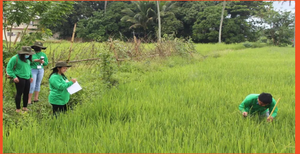
Participants immerse themselves in the process of AESA and MOET.

KALIBO, Aklan – Nineteen Municipal Rice Coordinators and Report Officers completed the Refresher Course on Updated PalayCheck System and ICT Services in Rice Production held last August 22-26, 2022, at Bee Bee Lodge, Old Buswang. This training course aimed to enhance the knowledge, skills, and attitude of Municipal Rice Coordinators of the Region on the updated PalayCheck System and ICT services in rice production.