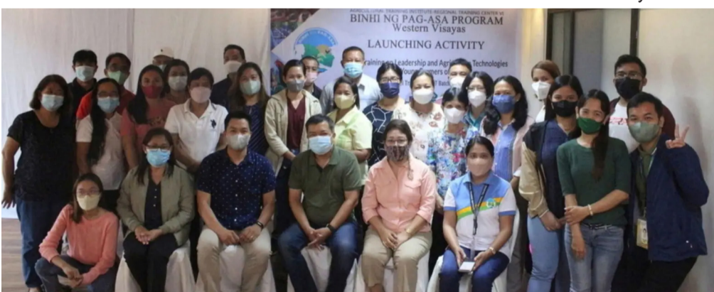
Implementers of the BPP program in the province of Iloilo are all set to empower the youth in the agriculture sector.

TIGBAUAN, Iloilo – With the goal is to attain food sustainability through youth empowerment in the agriculture sector, ATI Region 6, in partnership with the Office of Senator Grace Poe (OSGP), launched the Binhi ng Pag-Asa Program (BPP).