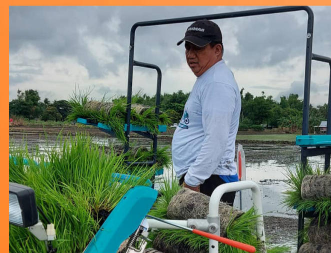
Embracing the new technology, driving the transplanter is the key.

Since his strength lies in farm mechanization, Solmmy also calls for the expansion of training on focusing on the machines. "In my assessment, issued seeders and transplanters, for example, has a utilization value of about two percent. Since crop establishment is an expensive process, training on the operation of such machines must be focused on to avoid extensive losses," Solmmy stressed.