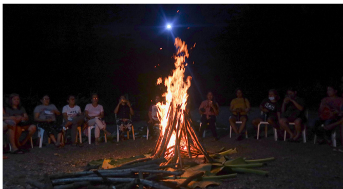
A moment of reflection. ATI personnel, together with the Resource Person, process emotions and aspirations during the bonfire session.