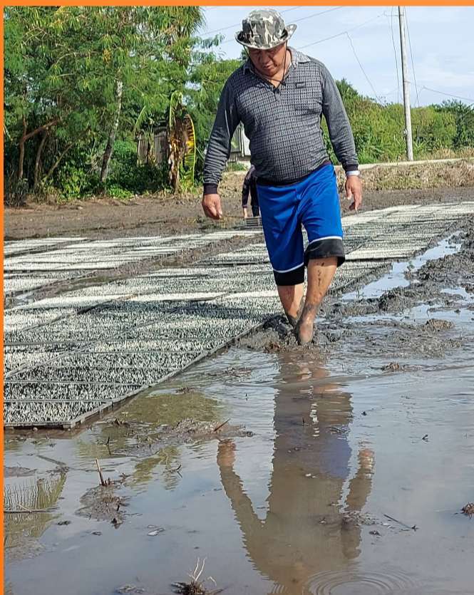
His everyday scene and routine - muddy feet, dirty hands, and soaking under the sun.