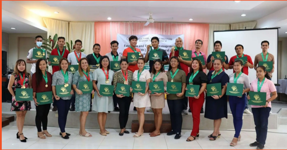
The 25 AEWs from Aklan and Capiz present their training certificates as the first batch of the ETMC completers.

BANGA, AKLAN – Twenty-five Agricultural Extension Workers (AEWs) from different local government units in the provinces of Aklan and Capiz completed the Extension and Training Management Course (ETMC) for Agriculture and Fisheries Technologists held on June 6-29, 2022, at ATI Training Hall, ASU Compound, Banga, Aklan.