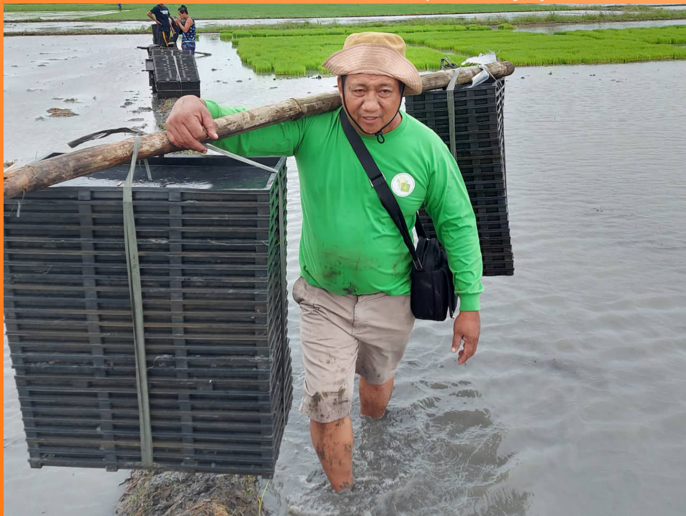
Solmmy immerses in the rice field's muddy waters to prepare for the next planting activity through the aid of the transplanter.