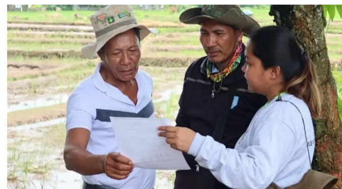
The participant explains the one-page RCM recommendation to the Rice farmers of Barangay Lopez Jaena, Murcia, Negros Occidental right after they were registered to the Farmer and Farm Lot Registration and verified their field using GPS.

BACOLOD CITY, Negros Occidental - Twenty-three Agricultural Extension Workers from the different municipalities and FITS Centers of Negros Occidental were trained on the Rice Crop Manager Advisory Service v.4.0 last August 23-26, 2022 in Bacolod City.