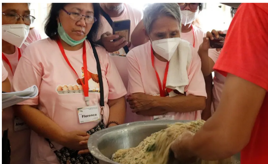
Participants keenly observe and take notes of steps on how to make their chicken feed.

PAVIA, Iloilo - To promote sustainable livelihood for low-income individuals, ATI Region 6, together with the Department of Social Welfare and Development and the National Irrigation Administration, conducted two batches of the three-day training on Chicken Egg Production cum Gender Role Awareness last October 20-22, 2022 at the Taytay sa