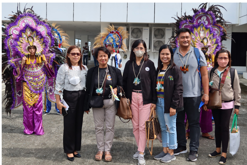
An ati-atihan-themed dance welcomes the delegates of the activity, in photo are participants from ATI Region 2 (Cagayan Valley).

Partnerships and Accreditation Division in Central Office spearheaded the 2022 Banner Program Assessment.