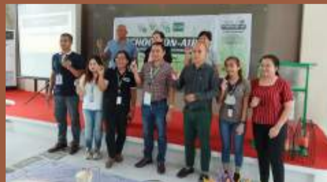
The PalayAralan sa Radyo is back through a solid partnership with the Department of Agriculture, its attached agencies, and the Local Government Units.

BAROTAC NUEVO, Iloilo - The School-on-the-Air on Smart Rice Agriculture (SOA-SRA) launched its third season last March 14, 2023, at the INA Farmers Learning Site and Agri-Farm. ATI Region 6, with