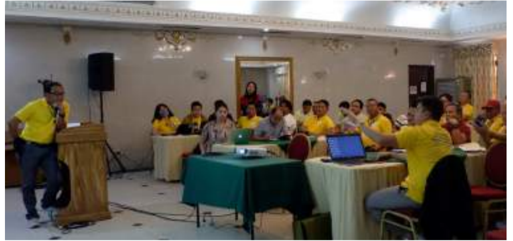
Region VII, with facilitators from the DA and its attached agencies, throw ideas during the breakout session.

ILOILO CITY, Western Visayas - Some 200 stakeholders of the rice industry participated in the Visayas-wide Cluster Rice Technology Transfer Workshop last June 13-15, 2023 at Punta Villa Resort, Villa Arevalo, Iloilo City.