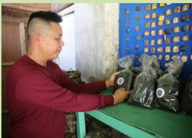
ADC farm also sell charcoal briquettes to utilized coconut shells that cannot be used to make handicrafts.