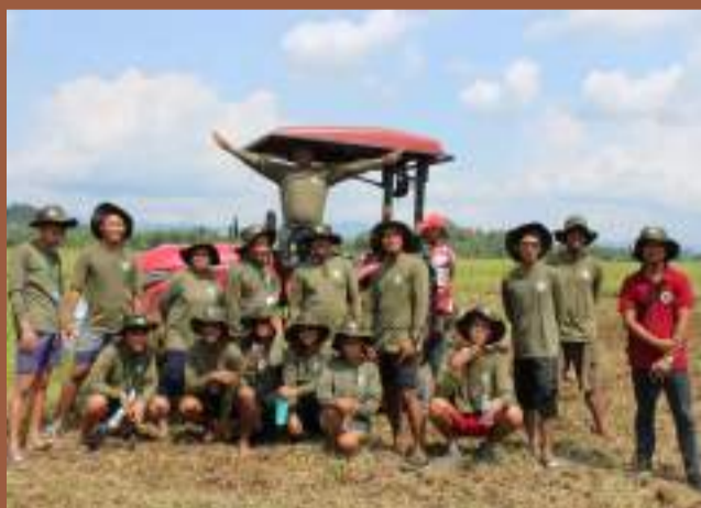
Participants take rest after operating the four-wheel tractor during their farm machinery demonstration session.

BANGA, Aklan - ATI Region 6 conducted the fourth Training of Trainers on the Production of High-Quality Inbred Rice and Seeds and Farm Mechanization at the ATI Training Hall, May 8-19, 2023. Twenty-eight Aklanon trainers from different Learning Site for Agriculture participated in the intensive 12-day program.