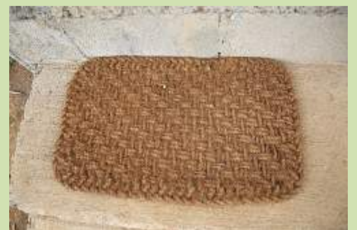
Coconut rug is also one of the diverse products that ADC farm has developed from coconut wastes.