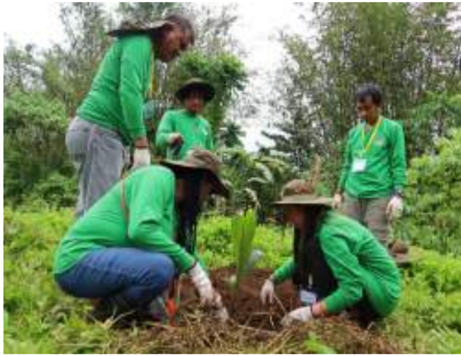
AEW participants of the CSTC perform coconut seedling selection and planting during the field practicum at St. Rafael Farm in Libas, Banga, Aklan.

BANGA, Aklan - To develop a core of regional facilitators who will assist in implementing the different training activities under the Coconut Farmers and Industry Development Program (CFIDP), the Agricultural Training Institute (ATI) - Region 6 conducted a two-week training on coconut.