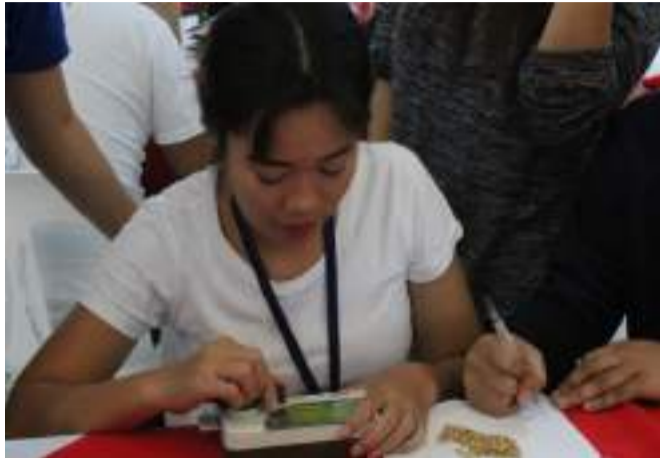
Participants conduct seed testing, particularly the practicum on moisture content determination during the fourth day of the training.

BANGA, Aklan - ATI Region 6, in partnership with the Bureau of Plant Industry-National Seed Quality Control Services (BPI-NSQCS), conducted a Training Course on Inbred Rice Seed Production and Certification for Deputized and Designated Seed Inspectors at the ATI-RTC VI Training Hall, ASU Compound, last March 27-31, 2023. Thirty-two Agricultural Extension Workers (AEWs) from different provinces and/or municipalities participated in the five-day intensive program.