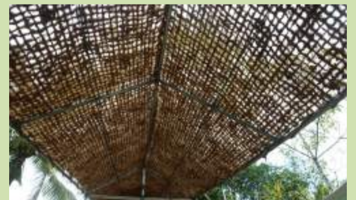
Coconut rope serves as shade at the farm's entrance.