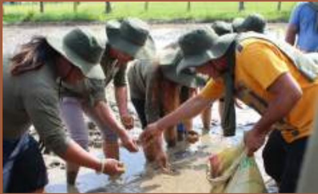
Participants get down to demonstrate the advantages of the Double Mulching Technique.

BANGA, AKLAN- Twenty-nine trainees participated in the Training of Trainers on the Production of High-quality Inbred Rice and Seeds and Farm Mechanization last March 6-17, 2023, at ATI Training Hall.