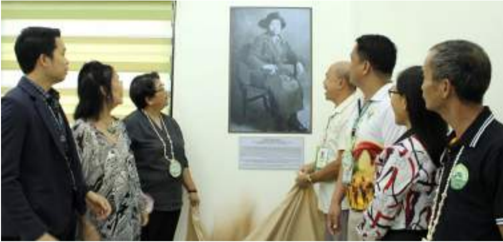
The ceremony inaugurated the 'Maria Y. Orosa Hall', honoring the Filipina food scientist and founder of home extension in the Philippines.