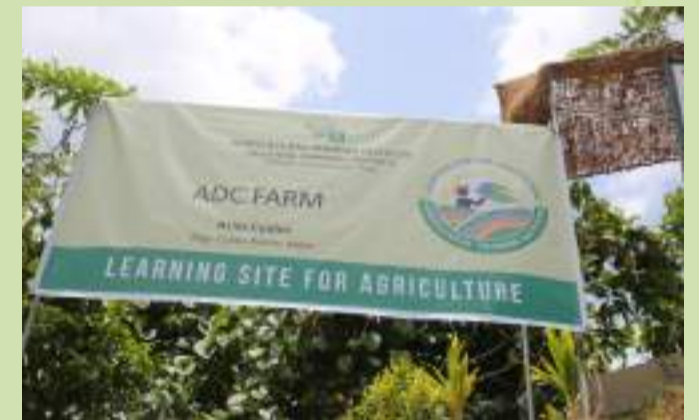
In 2023, ADC Farm formally became one of ATIs accredited learning sites for agriculture.