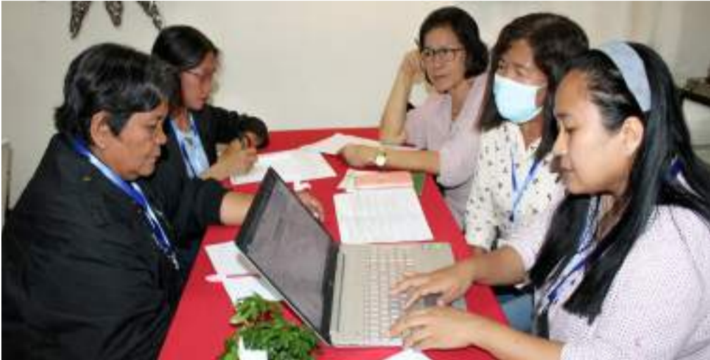
The Antique group during the workshop on identifying factors/challenges that affect extension activities and their capacitation needs.

WESTERN VISAYAS- ATI Region 6 conducted three batches of Rice Program Consultation and Planning Workshop last January 12-13, 19-20, and 24-25, 2023, respectively. The activity was attended by a total of ninety Provincial and Municipal Rice Program Coordinators, Report Officers, and Municipal Agriculturists regionwide.