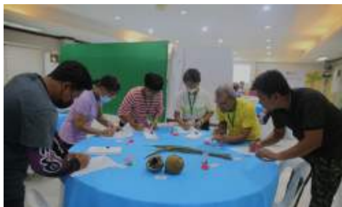
Participants identify the various coconut pests and diseases during a hands-on exercise facilitated by the resource person from the PCA.

BANGA, Aklan - To further develop a core of trainers and facilitators in the region who will assist in the implementation of the different training activities under the Coconut Farmers and Industry Development Program (CFIDP), the Agricultural Training Institute (ATI) - Region 6 conducted the second Batch of the Coconut Specialist Training Course (CSTC).