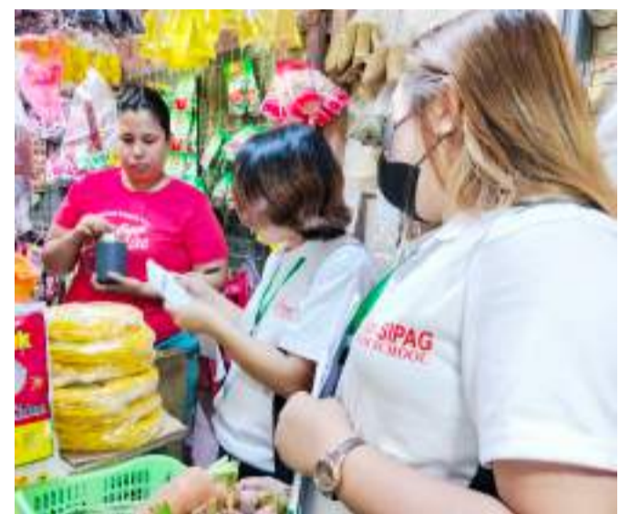
The market survey activity served as an exercise for trainees to identify the needs and preferences of customers and the strategies and marketing styles of retailers.

SAN MIGUEL, Iloilo -Twenty (20) LSA owners and farmers from Antique, Capiz, Iloilo, and Negros Occidental participated in the 3-day training on Farm Business School (FBS).