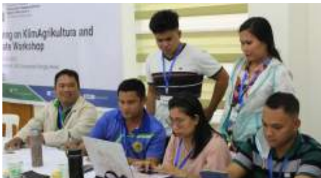
Participants from the first batch of KlimAgrikultura are concentrating during their workshop on Climate Crop Calendar (CC).

BANGA, Aklan - Given the mandate of the Agricultural Training Institute (ATI) role as the capacity builder, knowledge bank, and catalyst of the Department of Agriculture (DA), in collaboration with PAGASA, conducted its first batch of Training on KlimAgrikultura and Climate Workshop last February 6-10, 2023 at the 4-H Club Hub, ATI-RTC VI, ASU Compound, Banga, Aklan.