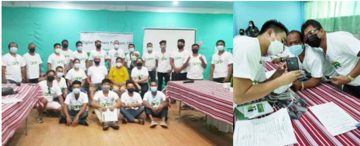
Face to face at Carmen, Bohol (DFP-101)

The center conducted two (2) batches of Digital Farmers' Program (DFP) regionwide with 4Hers and young farmers for Batch 1 as participants while Batch 2 is with Carmen Samahang Nayon Multi-Purpose Cooperative (CSNMPC)