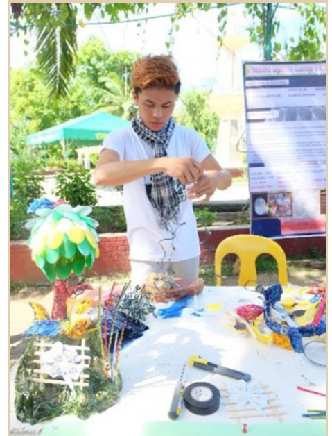
A 4Her demonstrates his flower making skills on one of the contest during the 27th RFFF Congress held in Bogo City last April 19-21, 2017.