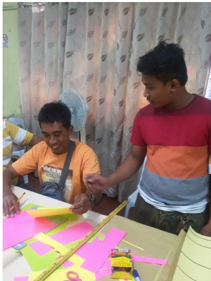
Visual aid preparation is one of the activity during the GAD-based EDS training held in Cebu last April 18-20, 2017