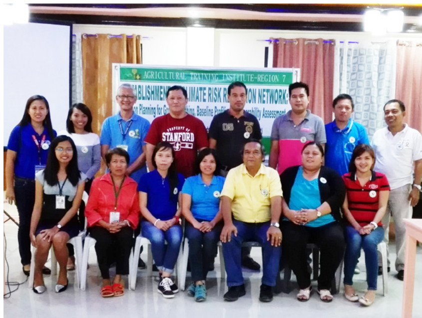
The eight-agency network spearheaded by ATI in Central Visayas together with representatives from BFAR-Bohol; PCA-Bohol; NIA-Regional Office 7; DA-RFO7; PAGASA-Bohol; PPDO-Bohol and PDRRMO-Bohol