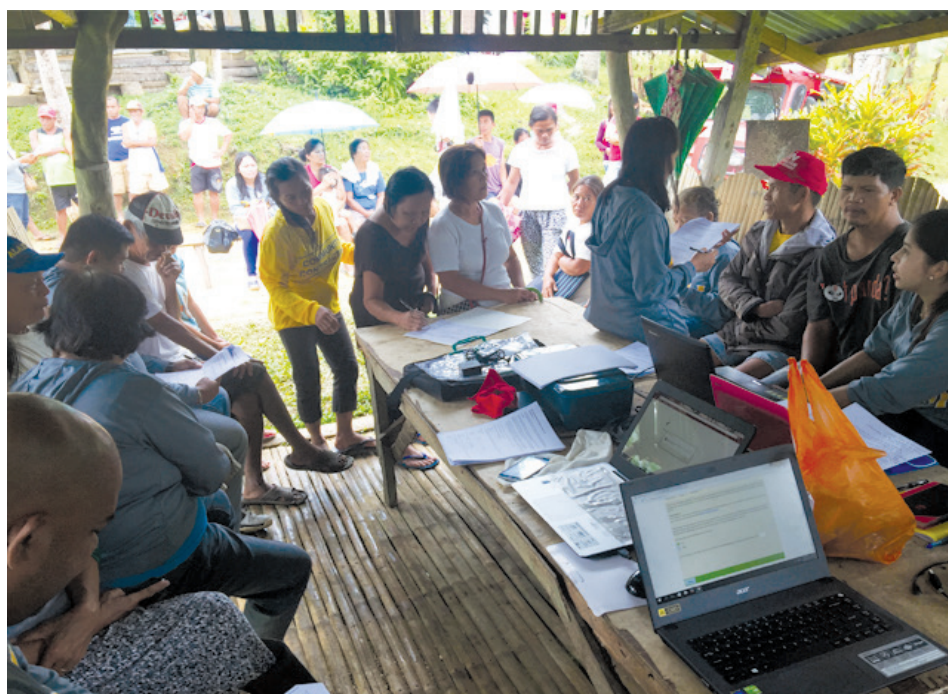
Farmers waiting for their turn during one of the Rice Crop Manager (RCM) briefing conducted in the region

With this tool, farmers are encouraged to follow the recommendation provided by the RCM to optimize the farmers' yield. If recommendations will be followed, the country will have additional production of 20,000 metric tons of milled rice for each 100,000 hectares of rice cultivation per season.