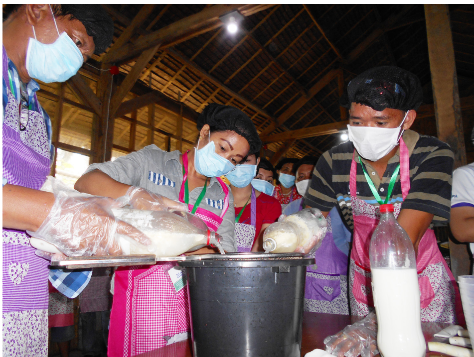
The participants actively enjoyed the hands-on activity on indigenous feed preparation during the IDOFS Training

This collaborative effort is the first between ATI and DOJ-Parole and Probation Office with the objective of enhancing the skills of the participants on IDOFS as well as Gender and Development that can help into their family's income generating initiatives.