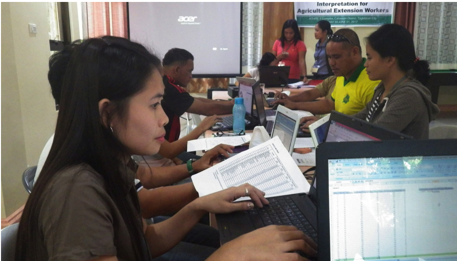
Agricultural Extension Workers from the Provinces of Bohol and Siquijor appreciated the step-by-step process of data tabulation and interpretation during the capability building training held at ATI-RTC 7 Complex, Tagbilaran City last May 30 to June 1, 2017.