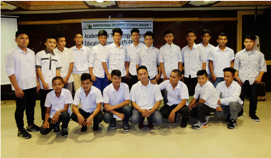
The 20 EP learners of ATI in Central Visayas during their culmination program at Bohol Tropics Resort, Tagbilaran City last May 27 2017

T wenty ATI-EP learners who are at their elementary level ages 14-21 years who want to pursue secondary education was conferred during the culmination program held at Bohol Tropics Resort Hotel, Tagbilaran City last May 27, 2017 after they completed the six-month in-house and on-field training at ATI-Regional Training Center 7 and selected demonstration farm in Bohol together with the Department of Education-Alternative Learning Systems (DepEd ALS). Part of their expected output is to establish a backyard garden in their respective households.