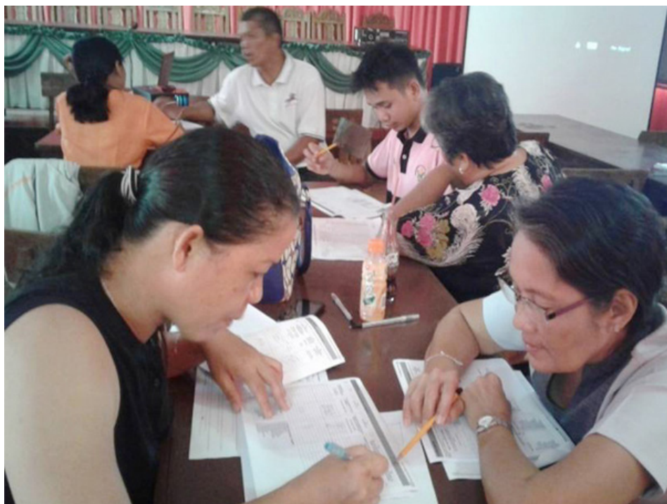
Agricultural Extension Workers from Siquijor brainstormed during the TIER 2 briefing conducted last May 25, 2017