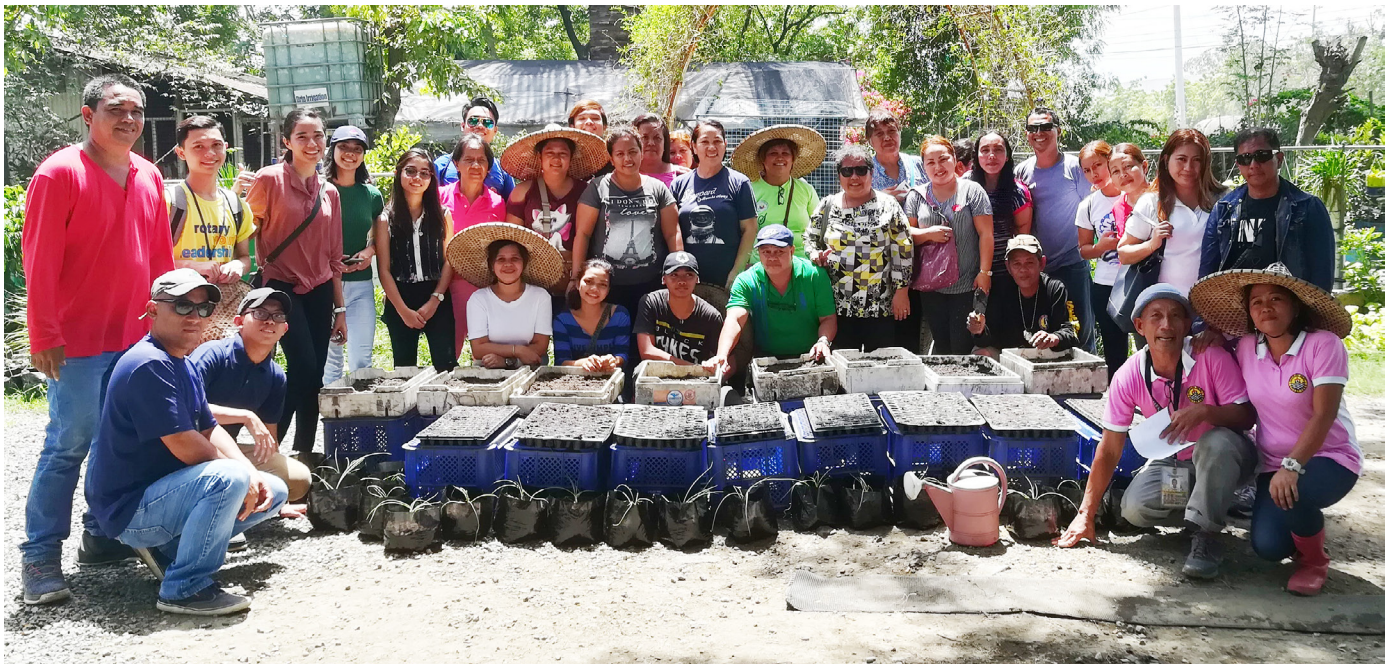
The eight-batch participants pose with their outputs at the Cebu City Department Nursery during the Glamourizing Farming through Urban Agriculture in Metro Cebu last May 29-31, 2018 with resource speakers and nursery assistants

Glamourizing Farming Through Urban Agriculture training was conceptualized when the Department of Agriculture (DA) Secretary Emmanuel Piñol declared that DA will refocus on urban agriculture. This move is the result of his observation that there are a lot of vacant spaces in urban areas that could be turned into vegetable gardens. Urban agriculture contribute to food security and food safety in two ways: first, it increases the amount of food available to city dwellers and allows fresh vegetables and fruits to be made available to urban consumers. Second, it promotes safe food systems and ecological waste management techniques. ATI, being the training arm of DA and lead agency that also handles the 4-H Club of the Philippines, envisions the urban youth