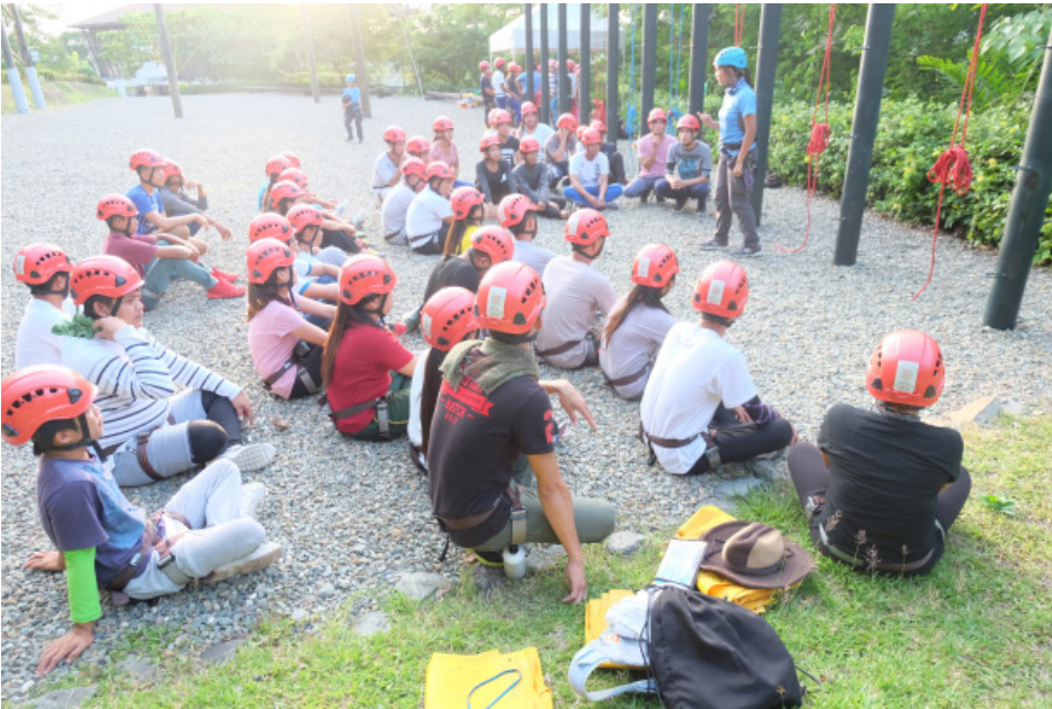
Youth participants listened intently as the RAFI Facilitator briefed them the mechanics of the strenuous team-building activity during the encampment for agrillenials