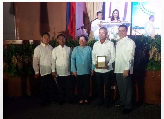
The awardee together with the DA-RFO 7 and ATI-RTC 7 honchos

MANILA. - The Department of Agriculture recognizes the effort and support of its stakeholders towards agricultural development. At Philippine International Convention Center (PICC), last May 31, 2018, DA together with Agricultural Training Institute (ATI) and other line agencies celebrated the 2017 Rice Achievers Awards with the theme "Pagpupugay sa mga Natatanging Lalawigan, Bayan/Lungsod, Irrigator's Associations (IAs) at Small Water Irrigation System Associations (SWISAs)".