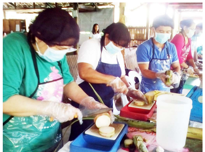
The participants did the actual hands-on application during the OAP-NC II Assessment held in SPAAFI, Alegria last June 22-24, 2018

The three-day assessment conducted by the TESDA-LAZI in coordination with the Lazi Technical Institute, a TESDA Accredited OAP-NCII Assessment Center based at Siquijor, tested the competence of the participants on organic agriculture through the conduct of the written exam, practicum and oral interview.