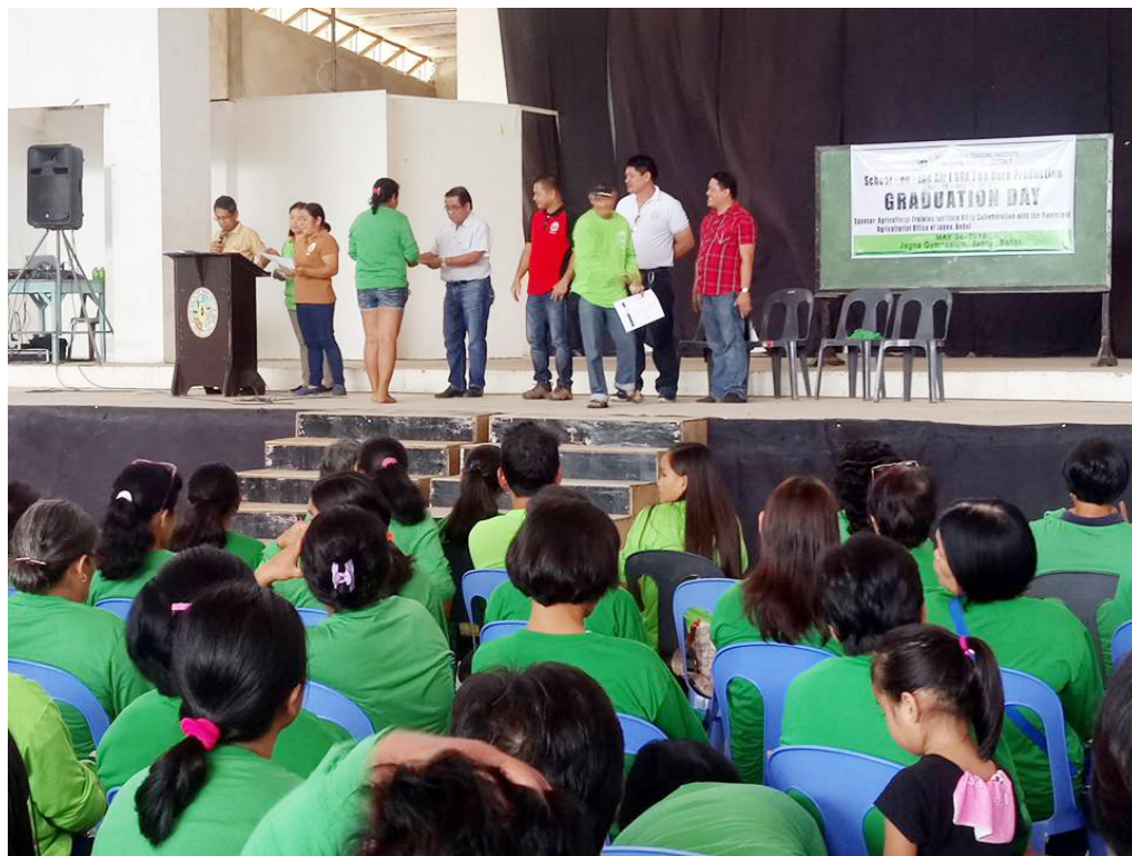
Distribution of the certificate of completion to successful graduates during the School-on-the-Air (SOA) on Corn Production graduation at Jagna Gymnasium. The magazine-type SOA was aired over DYJP 101.3 FM in Jagna, Bohol