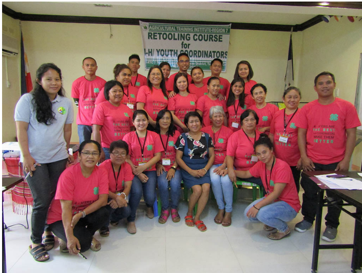
4H Coordinators in the Region during the retooling course held at ATI-RTC 7 Training Complex, Tagbilaran City last May 2-4, 2018

A three (3) day retooling course for Bohol 4-H club/Youth coordinators was conducted at the Agricultural Training Institute (ATI) Regional Training Center, Cabawan District, Tagbilaran City from May 2-4, 2018.