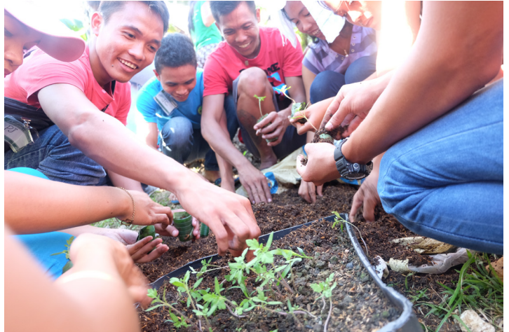
BINHI ng Pag-asa youth participants enjoyed the hands-on activity during one of the training conducted in the province of Bohol

The selection of the recipients is in close coordination with the Provincial and Municipal Local Government Units (LGUs) of Bohol and Cebu. Out-of-school youth who are engaged in farming and 4-H members were given priorities.