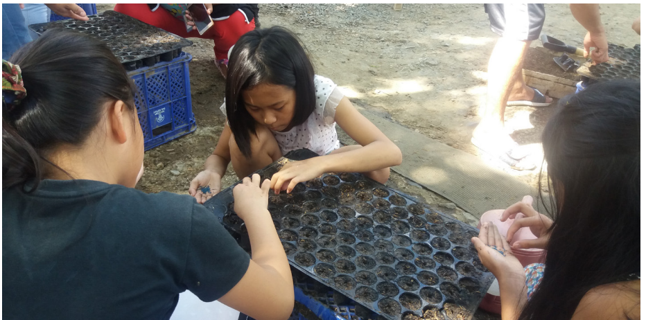
Youth-trainees eagerly exercise the proper seed preparation