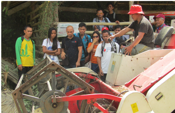
The participants tried the farm-machinery equipment during the training of trainers on hybrid rice production

With the objective of enhancing the knowledge and skills of farmers on up-to-date technologies and farming techniques on hybrid rice production, the Agricultural Training Institute-Regional Training Center 7 conducted two (2) batches of Training of Trainers in the region last May 21-25 and May 28-June 1, 2018 respectively.