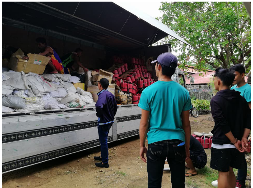
The after training support distributed to BINHI ng Pag-Asa beneficiaries at the province of Cebu