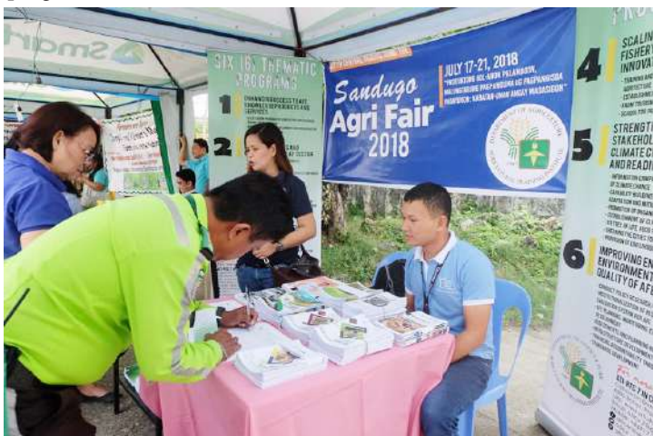
Walk-in clients grab IEC materials at ATI-7's booth during the Sandugo Agri Fair 2018 at Bohol APC Grounds, Tagbilaran City last July 17-21, 2018

One hundred thirty-six individuals logged in to our acknowledgment sheets who apparently received a variety of IEC materials from the institute which include corporate communications, crops and livestock, briefers about the programs, services offered and a lot more.