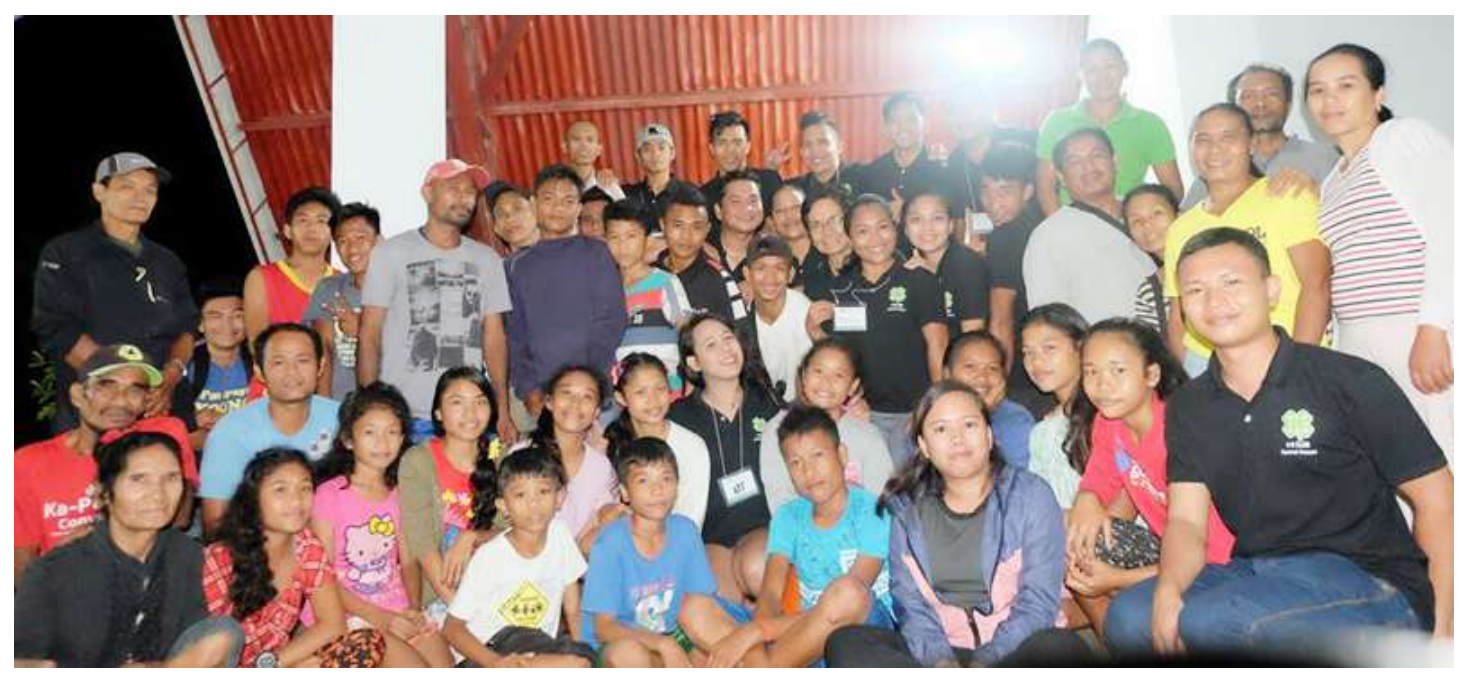
Youth participants with the Tribal Elders, leaders and family members of the Ata Community in Canggohob, Mabinay, Negros Oriental during the 4-H Sensing Journey held on September 10-14,2018.

EGROS ORIENTAL. Eleven 4-H Youth Regional Officers and 4-H Coordinator successfully completed the five-day Sensing Journey to Indigenous People's (IP) Community in Canggohob, Mabinay this province on September 4-6, 2018.