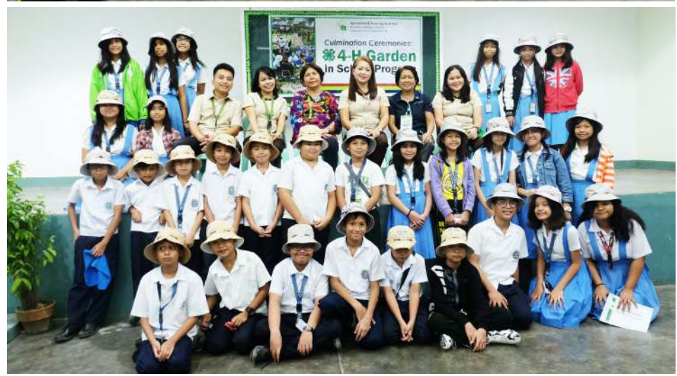
The participative Grade V pupils of Holy Name University-Basic Education Department

finished the activity. Through the kid's enthusiasm, ATI-7 acknowledged their efforts by recognizing these children through special awards like Best Garden Design; Green Thumb; Young