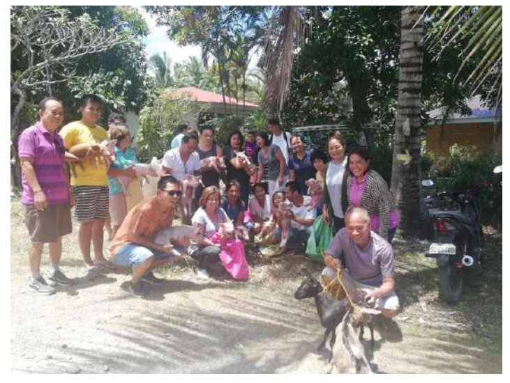
The ten (10) beneficiaries of the farm family in Dumaguete City wore a happy face after they received their agricultural farm support.

UMAGUETE CITY – The Agricultural Training Institute in Central Visayas distributed agricultural support to ten (10) family-beneficiaries of the ATI's Farm Family Modeling Program last March 14, 2019, this city.