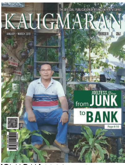
KAUGMARAN (n) Cebuano-Bisaya term for development

Say Hello on Social Media instagram.com/aticentralvisayas facebook.com/aticvisayas twitter.com/aticv