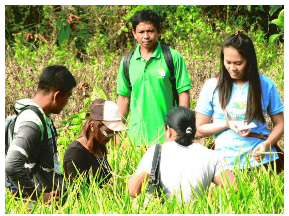
Local Farmer Technicians during their field work activities in time for their Training of Trainers held at ATI-7 Training Complex, Tagbilaran City last March 4-8, 2019