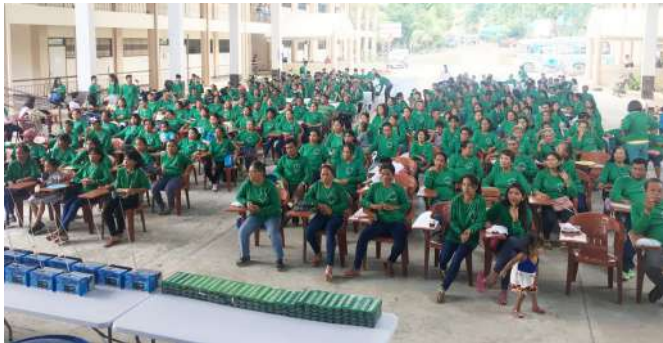
The School-on-the-Air (SOA) graduates composed of farmers from the province of Cebu convened at the covered court of CTU-Barili for their graduation activity last May 16, 2019

C EBU - Aiming to deliver necessary information to our farmers and livestock raisers of Barili, this province, the Agricultural Training Institute-7 through the Cebu Technological University aired a one-month School-on-the-Air (SOA) Program at the CTU-Barili based dyME 97.5 khz Radyo Kahimsog.