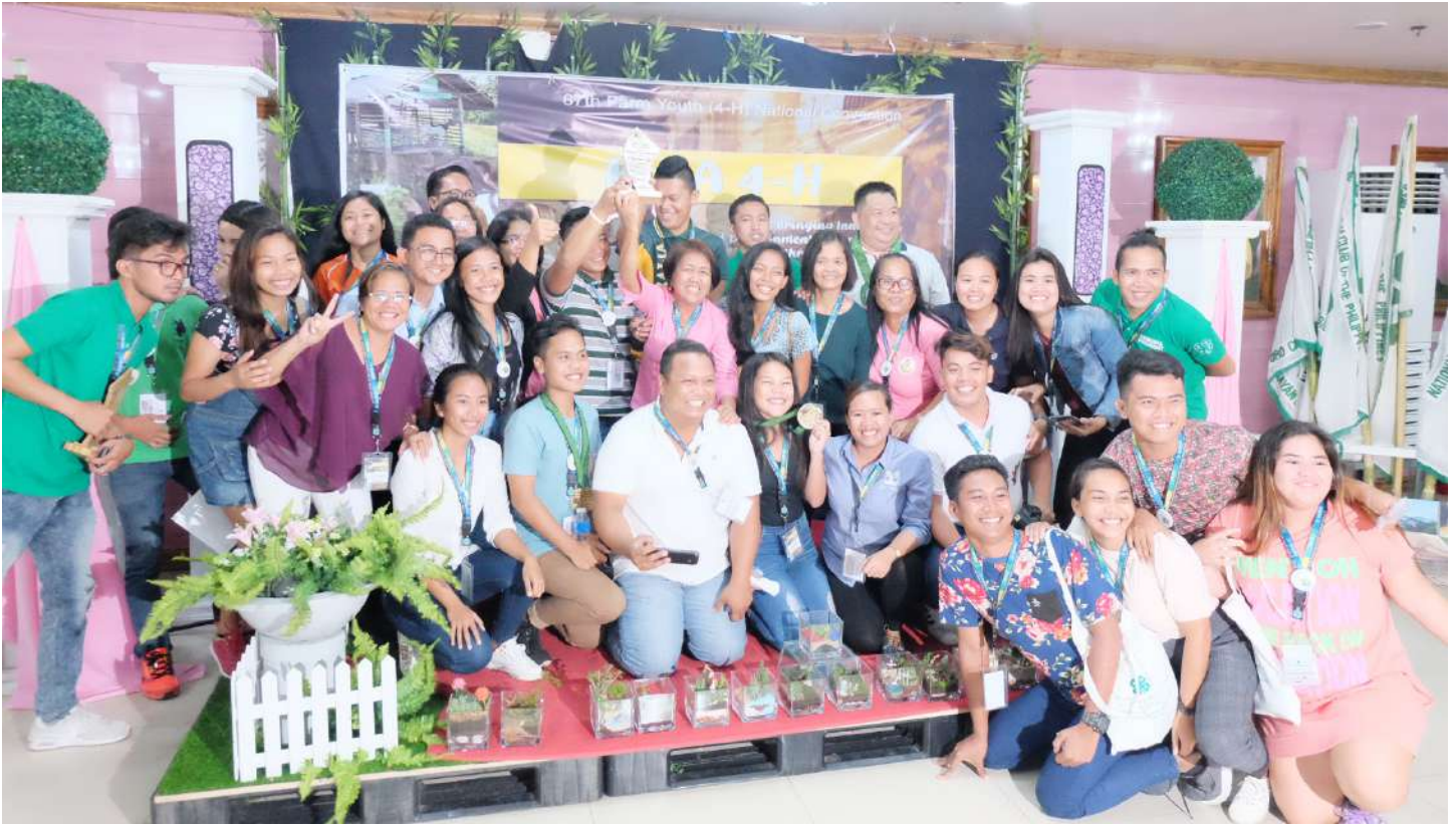
4H contingent from Central Visayas triumphantly posed for their winning as First Runner-Up during the 67th 4H National Convention held at Hotel Linda, Vigan City, Ilocos Sur last May 28-31, 2019

I LOCOS SUR - 4-H Central Visayas bagged the Overall 1st Runner Up award during the 67th Farm Youth (4-H) National Convention held on May 28-31, 2019 at Hotel Linda, Vigan City, this province.