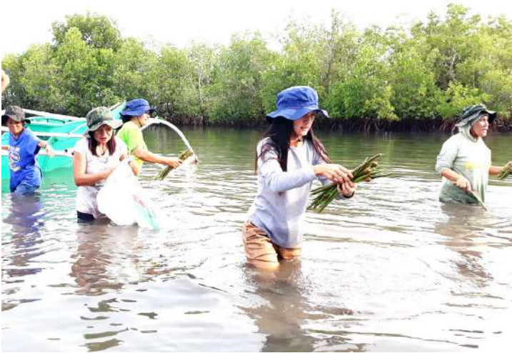
The participants during their mangrove planting activity at Tultogan, Calape, Bohol as an offshoot of the 3-day Training on Climate Change Adaptation and Mitigation last June 4-6, 2019

B OHOL – The Climate Resilient Agriculture (CRA) of the Agricultural Training Institute is now on its phase 2 with the municipalities of Tubigon and Clarin this province as the next site with Tultogan, Calape as CRA-1.