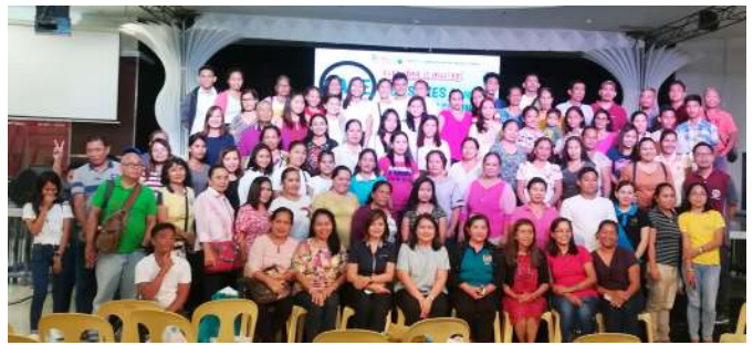
Walk-in clients who actively participated during the free seminar on food safety held at Island City Mall, Tagbilaran City last April 24, 2019

T AGBILARAN CITY - The Agricultural Training Institute – VII (ATI-7) in partnership with Alay Marcela Foundation and Department of Science and Technology (DOST) recently concluded a free seminar on Food Safety dubbed as 'Safe Food Saves Lives' at Island City Mall Activity Center, Tagbilaran City on April 24, 2019.