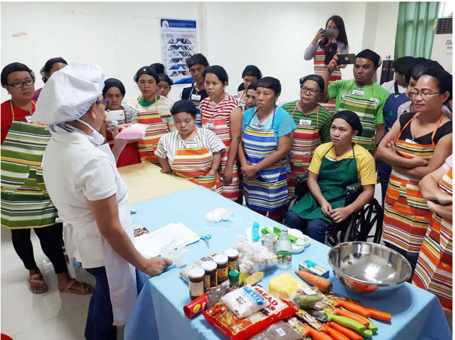
Interested PWDs intently listened to the inputs and tips discussed by the Resource Speaker during the three-day Training on Enhancing Capabilities of Persons with Disabilities last June 28-30, 2019 at Barangay Poblacion, Tubigon, Bohol

B OHOL – Twenty-four persons with disabilities (PWD) from Tubigon, this province participated in the three-day training on Enhancing Capabilities of Persons with Disabilities through Meat Processing last June 28-30, 2019 at the Farmers Information Technology Service (FITS) Center.