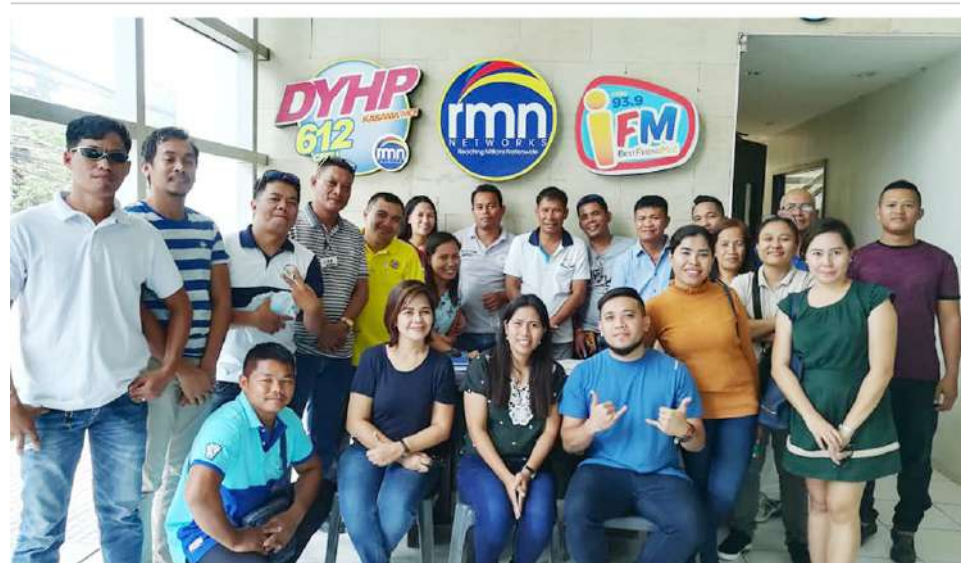
The participants composed of Agricultural Extension Workers and Information Officers from Region 7 during the three-day Training on Farmcasting/Broadcasting at Golden Valley Hotel, Cebu City last May 28-30, 2019