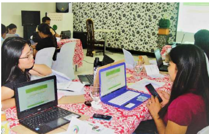
The AEWs during the hands-on workshop on the usability of the RCM App

T AGBILARAN CITY - Rice Crop Manager (RCM) is an application contributing to the implementation of appropriate modern precision farming by providing farmers with personalized crop and nutrient management recommendations matching their location-specific rice-growing conditions. Adjacent farmers with different rice-growing conditions receive different recommendations. These recommendations intended to increase rice production of farmer's field both irrigated and rainfed. Research from its first phase confirmed that farmers who followed the RCM recommendation could increase their yield and net income.