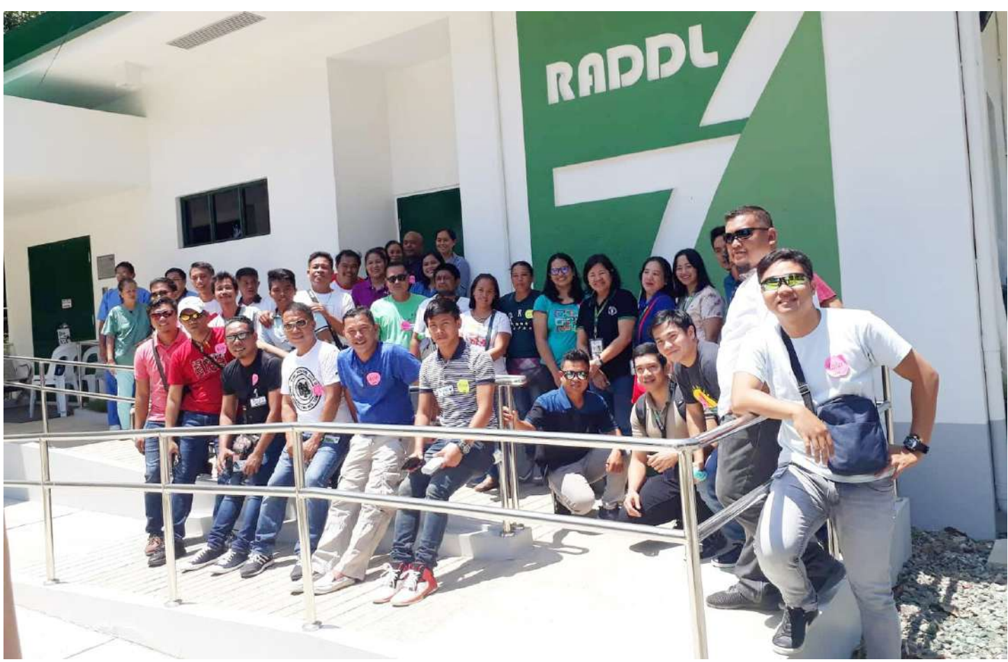
The participants composed of Agricultural Extension Workers (AEW) from Central Visayas pose at the facade of the Regional Animal Disease Diagnostic Laboratory (RADDL) building together with the team of resource speakers during their field tour.