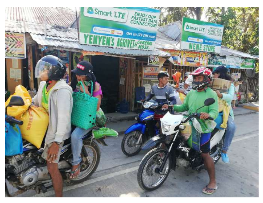
The farmer-beneficiaries of the Native Chicken Production Farm Family Modeling claimed their after training support consisting of one (1) cockerel and three (3) pullets plus 18kilograms of poultry pellets last July 18-19, 2019.