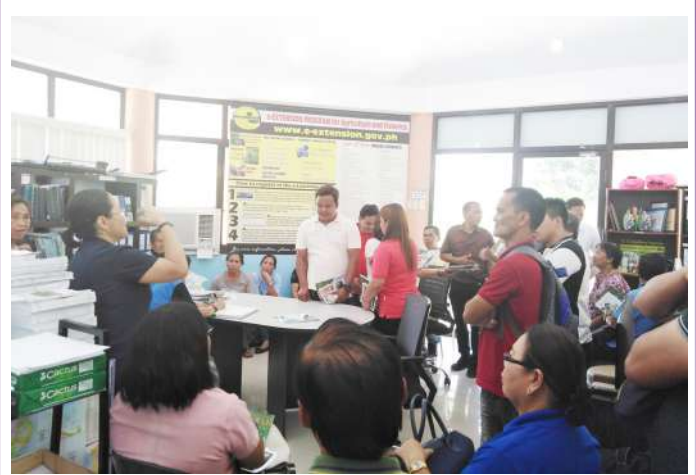
Walk-in clients in the region visited ATI in Central Visayas and were briefed on e-extension at the ISS Office.

ENTRAL VISAYAS - The Information Services Section (ISS) personnel of the ATI in this region, continue to conduct a briefing to walk-in clients with the objective of demystifying the e-extension program for agriculture and fishery of the Department of Agriculture.