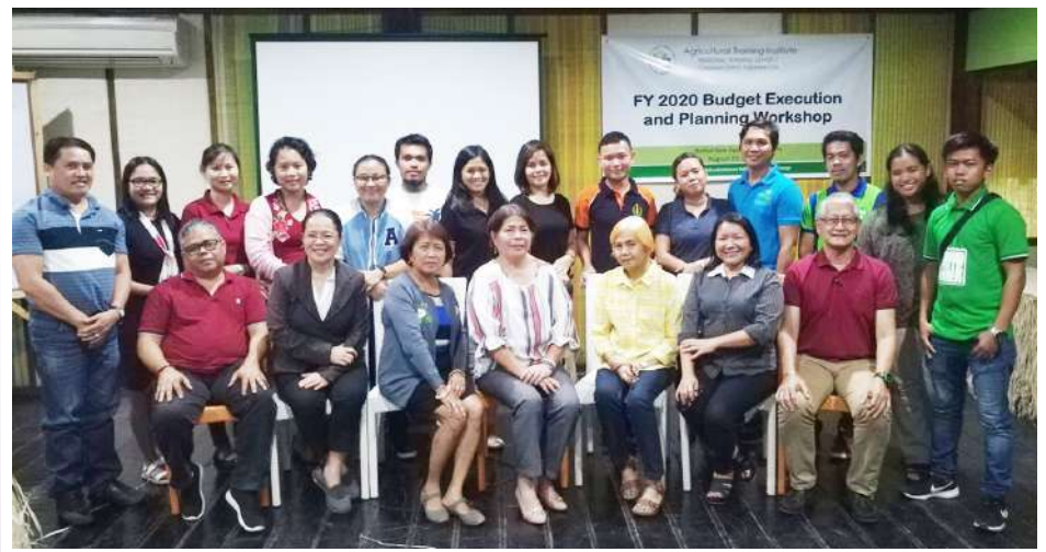
The men and women of ATI in Central Visayas during their planning and consultation workshop at Bohol Bee Farm in Dauis, Bohol last August 22-23, 2019.