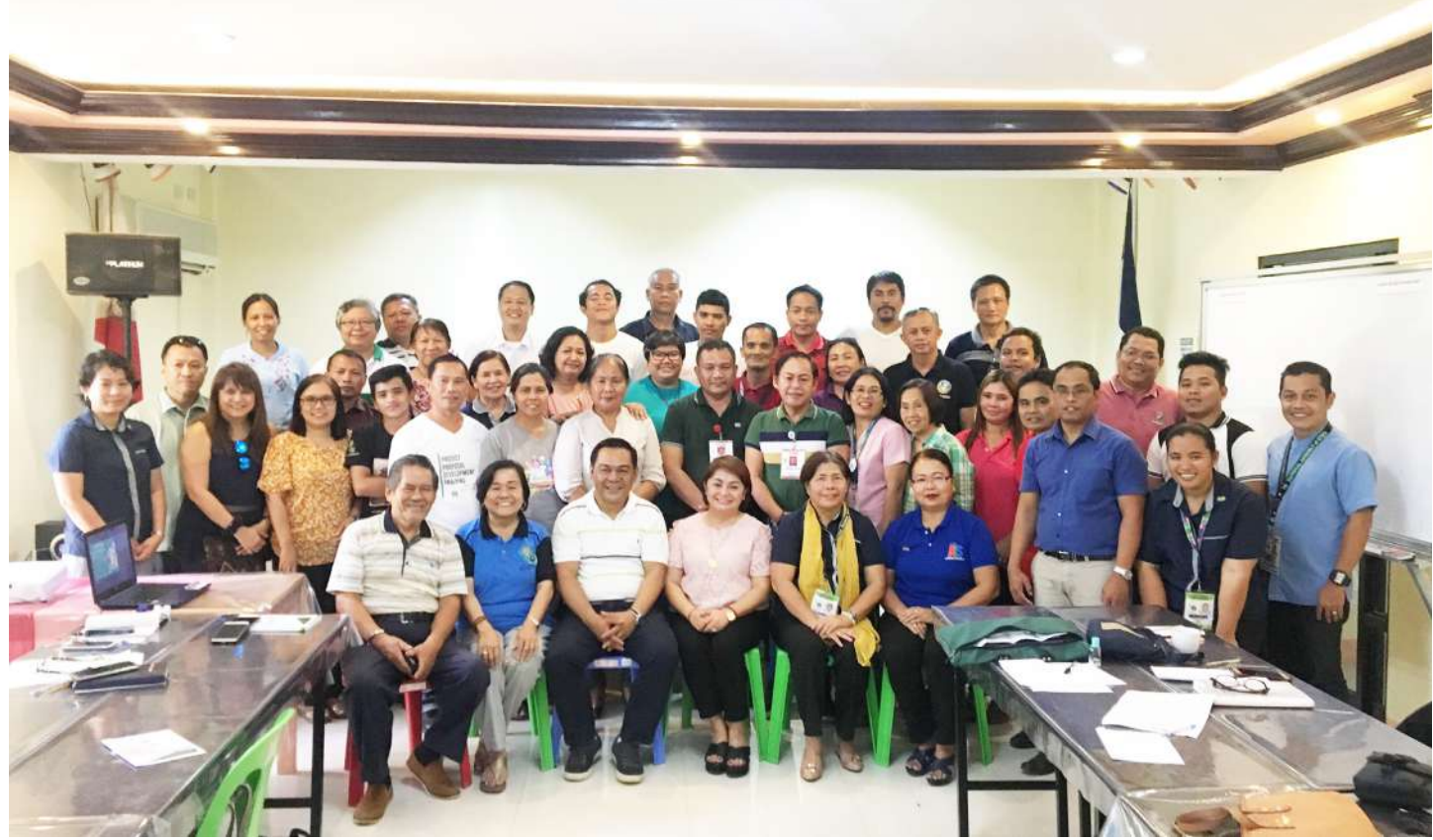
The multi-stakeholders participated the Bohol Provincial Consultation posed after the day activity together with the personnel of the Agricultural Training Institute-Regional Training Center 7 (ATI-RTC 7) at ATI7 Complex, Tagbilaran City last August 14, 2019.

the objective of the consultation is to primarily identify relevant training and extension agenda for CY 2020 and 2021