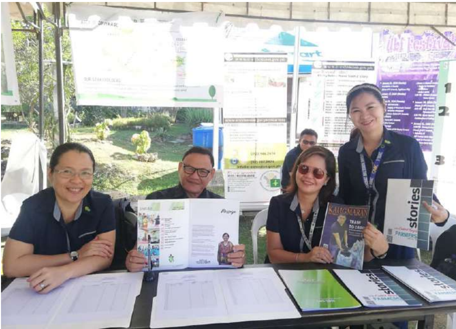
ATI-7 personnel manned the booth and showed-off a variety of IEC and corporate materials to be distributed for free during the 20th UBI Festival held at B-APC Grounds, Dao District, Tagbilaran City last January 28-31, 2020

T AGBILARAN CITY – The yearly celebration of the UBI Festival in Bohol recognizes the ubi growers who painstakingly labored to make the industry alive, thus, contributing a big pie to make the activity successful. Without them, there will be no festival to reckon with; hence, the Provincial Government of Bohol institutionalized through an approved ordinance to recognize and award the Boholano farmers who have sustained the ubi industry in the province.