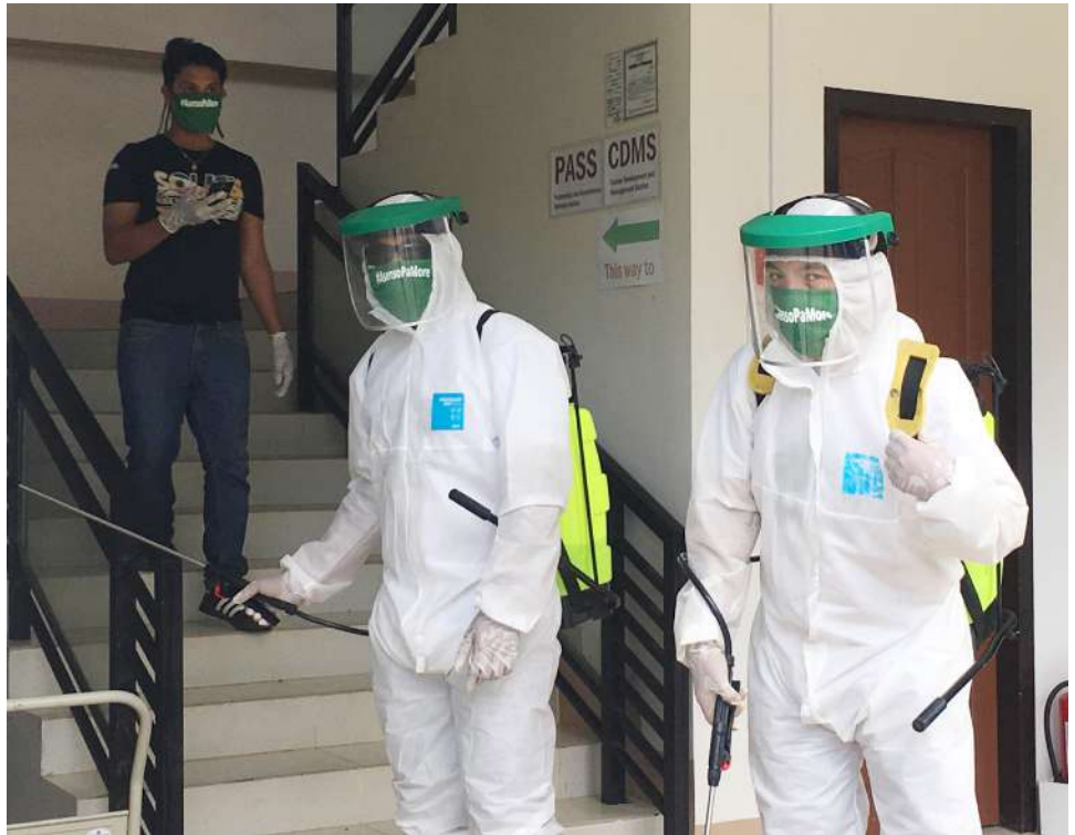
Full-geared CDRRMO-Tagbilaran personnel during the disinfection activity at ATI-7 Complex in Cabawan District, Tagbilaran City last March 24, 2020