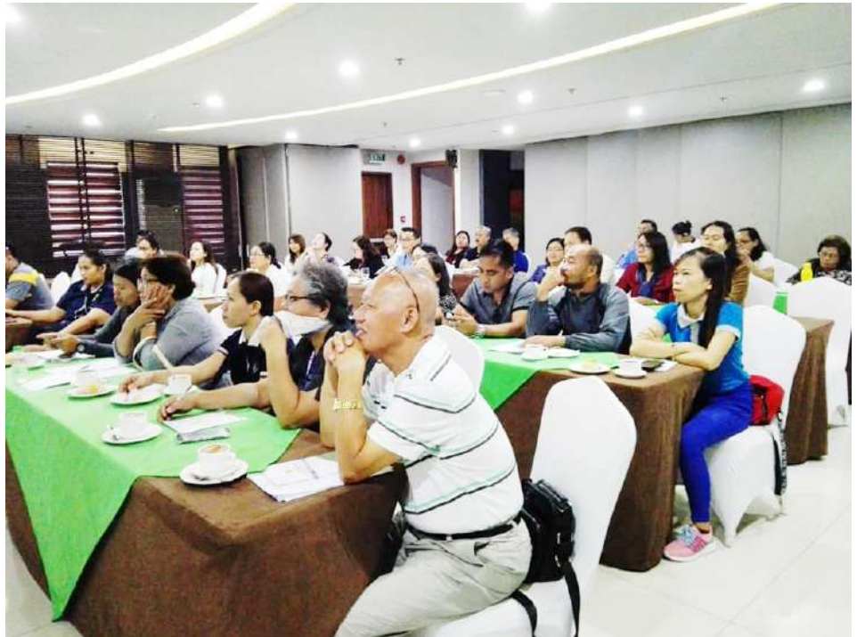
Agricultural Extension Workers of Bohol listened attentively to the inputs shared during the Provincial Consultation and Feedbacking of ATI-7 Training and Extension Programs for CY 2020 held at the Kew Hotel, Tagbilaran City last January 28, 2020

Among the impressions generated by the four consultations include the following written in verbatim: “In behalf sa Department of Agriculture, Salamat kaayo sa opportunity nga naka attend ani