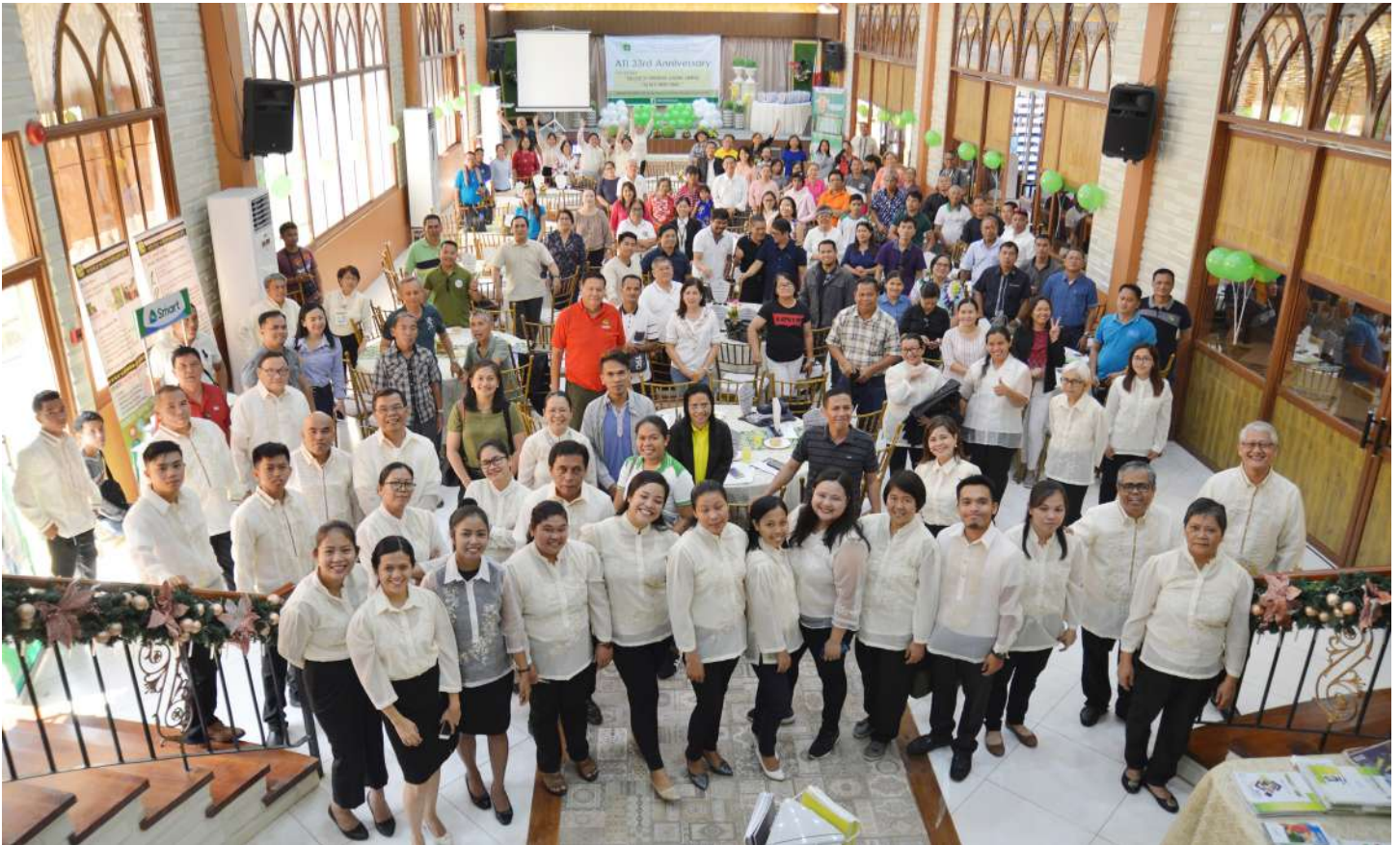
The well-attended ATI 33rd Anniversary held at The Grand Pavillion, Panda Tea Garden and Suites, Dao District, Tagbilaran City last January 30, 2020

T agbilaran City – On its 33 years of Extending Excellent Extension Services Beyond Boundaries, more than 100 participants coming from the different National Government Agencies, Local Government Units and the private sectors in the region, participated the Agricultural Training Institute's 33rd Anniversary held at the Grand Pavillion, Panda Tea, this city on January 30, 2020.