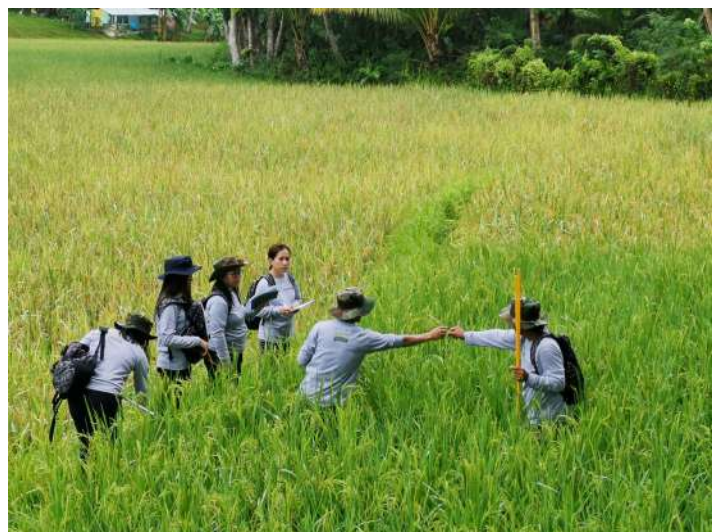
The participants on field work during the 12-day intensive training of trainers on High-Quality Inbred Rice Production and Seeds, and Farm Mechanization

Likewise, a free seminar on Preparation of Healthy Juices, Urban greens processing cum culinary medicine and series of Health and Wellness training was held in the region on the same year.