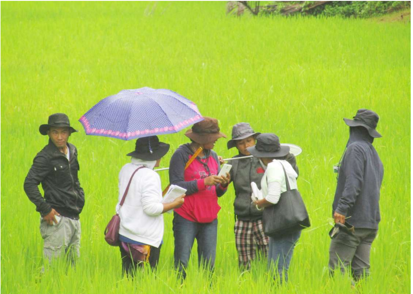
The gender-equally participated Training of Trainers for Local Farmers' Technicians on Updates of PalayCheck System and Rice Production last February 3-7, 2020 at ATI-7 Training Complex, Cabawan District, Tagbilaran City. Photo shows, the participants during their fieldwork