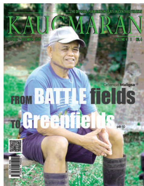
KAUGMARAN (n) Cebuano-Bisaya term for development

Livestock Program ATI awards Certificate cum Financial to LS High Value Crop Development Program Corn Program Bohol FITS' Centers Recieve Computers