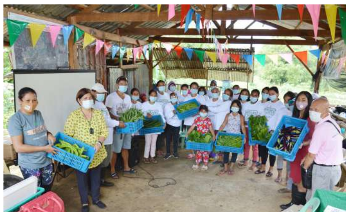
Members of KAKRISMARSRO's together with the Office of the Municipal Agriculturist of Maribojoc, Bohol and ATI-7 personnel during the harvest festival even amidst the threat of the pandemic

B OHOL – Upon the onset of COVID 19 outbreak, the Department of Agriculture's programs and priorities have been focused on the Plant, Plant, Plant Program to ensure that every Filipino family can survive amidst pandemic with enough food on their tables.