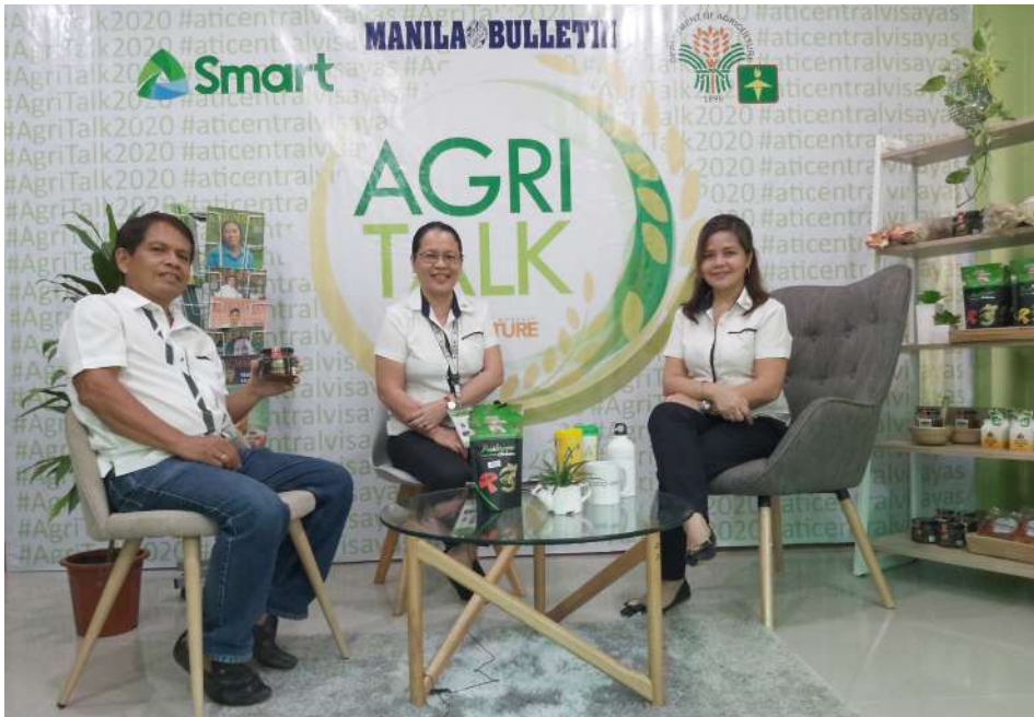
Personnel from the Information Services Section of ATI-7 spearheads the successful conduct of a 10-episode Agritalk via dyRD AM 1161kHz; BCCTV Channel 6 and FB Live at ATI-Central Visayas page which runs from October 12-23, 2020 from Monday to Friday

T agbilaran City – Over 80,000 views reached through its Facebook page and does not only include those covered through TeleRadyo on the recently concluded ATI-7 Agritalk.