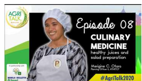
The three (3) resource persons behind the success of the Agritalk