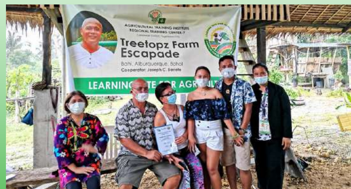
Another LS Certificate handed to Treetopz Farm Escapade of Pantad, Bahi, Alburquerque, Bohol

Meanwhile, three (3) LS inked their Memorandum of Agreement with ATI and were awarded with their Certificate. These farms are South Farm of Bolod, Panglao; Treetopz Farm Escapade of Pantad, Bahi, Alburquerque and Kahayag Farm and Social Action Center of Laya, Bacayon, all from Bohol province respectively.