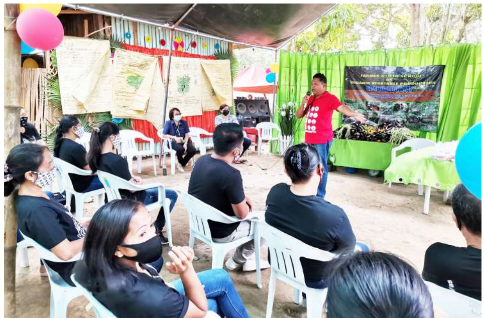
FFS Graduation at Amlan, Negros Oriental where fresh produce and activity outputs were displayed showcasing their 16-week activity