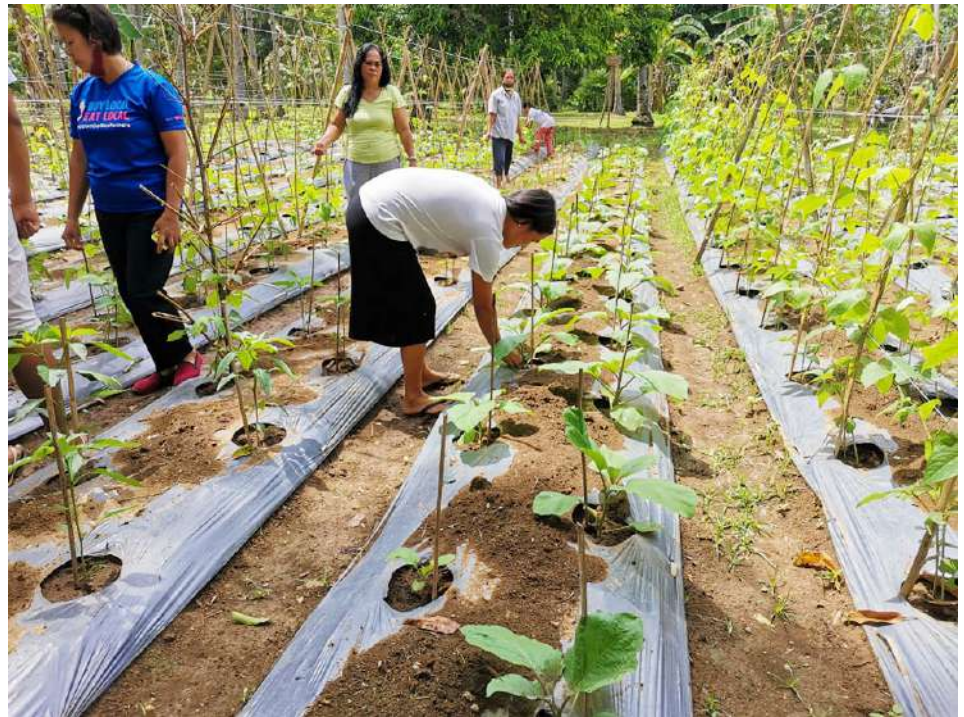
Duero, Bohol FFS site with women participants who were actively involved in all the field activities

The objective of the training is to enhance the knowledge, attitude and skills of the FFS participants composed of local organic vegetable farmers on the new technologies developed for organic vegetable farming, and help boost their interest to revive the organic vegetable industry in the locality.