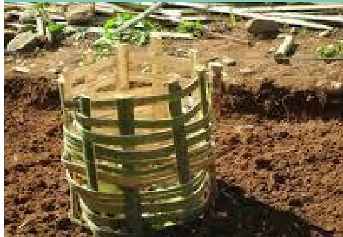
(sample of basket)