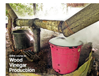
Online course on Wood Vinegar Production