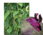
Yummy Yam Online Course on Ubi Production