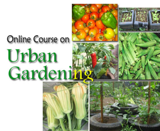
Online Course on Urban Gardening