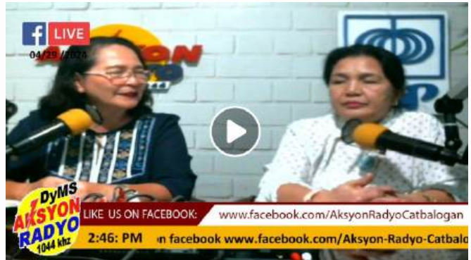
Screengrab from DYMS Aksyon Radyo Catbalogan

“SOA has been immensely beneficial to our local coconut farmers, providing them with essential information and practical skills that will undoubtedly contribute to improving their agricultural practices and enhancing overall productivity.”