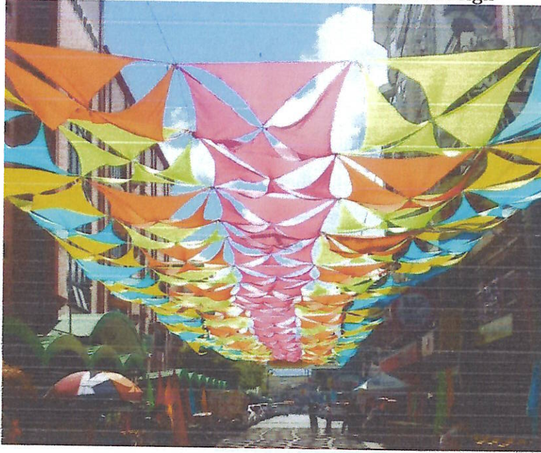
Gardens A, B, and C Overhead Banderitas Design

ATI Building, Elliptical Road, Diliman, Quezon City, Metro Manila 1100 Tel. Nos. (63-2) 8929-8541 to 49 & 8928-7397 Fax No. (63-2) 8920-9792 Email: ati_director@ati.da.gov.ph & ati_director@yahoo.com URL: http://www.ati.da.gov.ph ; www.e-extension.gov.ph