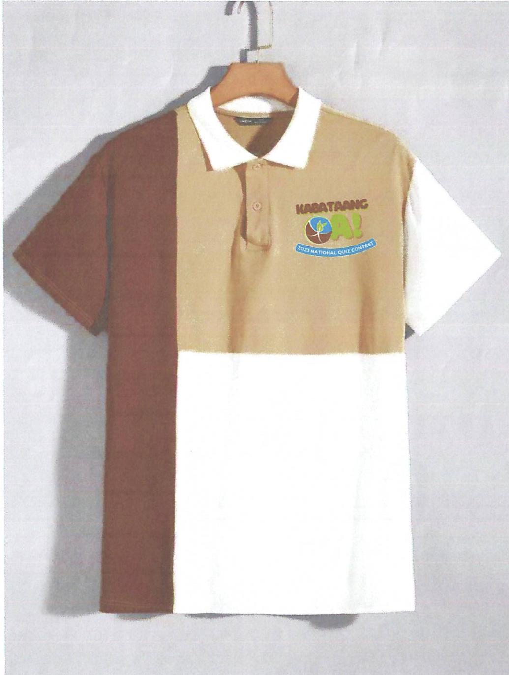
Customized Polo Shirt

ATI Building, Elliptical Road, Diliman, Quezon City, Metro Manila 1100 Tel. Nos. (63-2) 8929-8541 to 49 & 8928-7397 Fax No. (63-2) 8920-9792 Email: ati_director@ati.da.gov.ph & ati_director@yahoo.com URL: http://www.ati.da.gov.ph ; www.e-extension.gov.ph