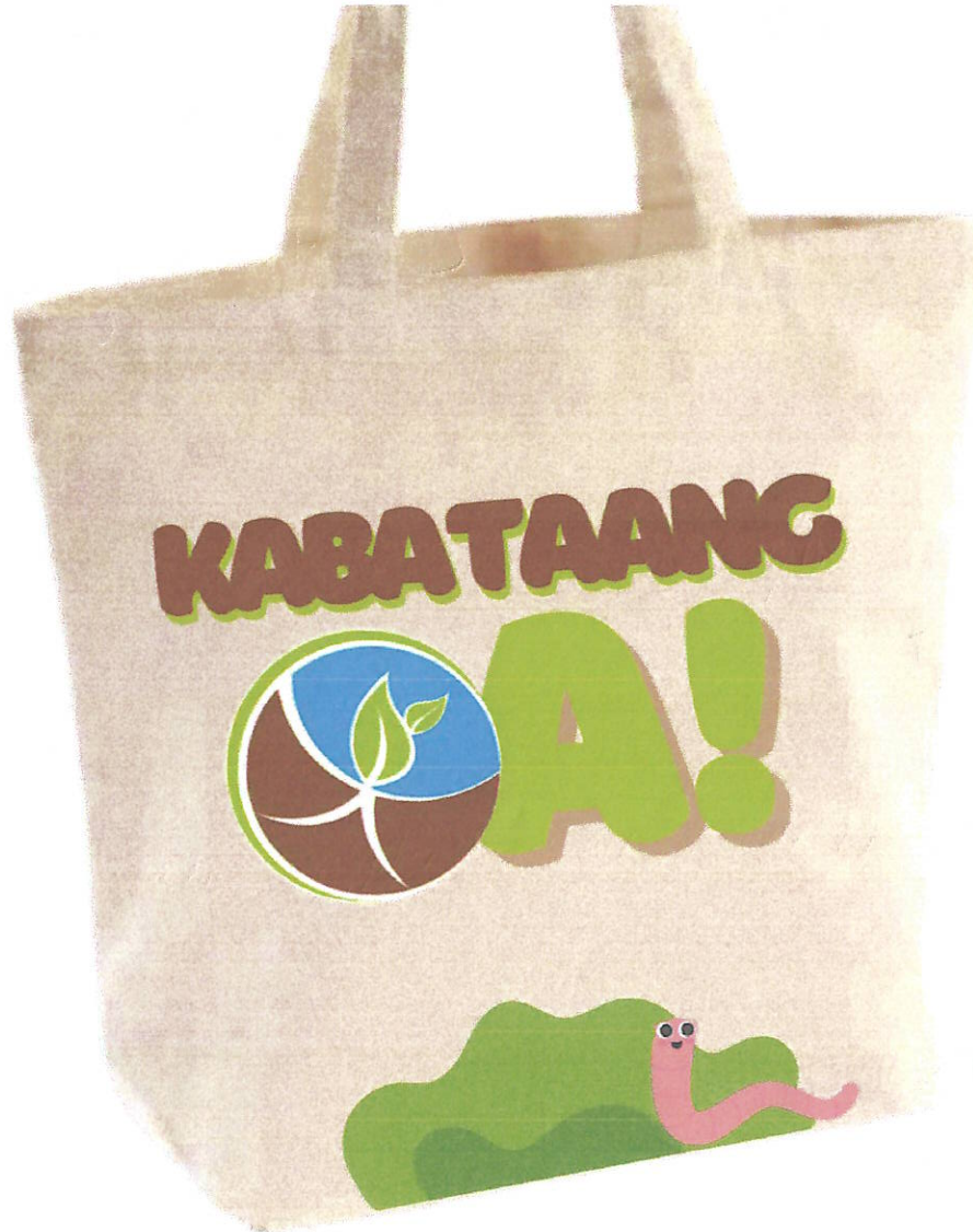
Customized Promotional Tote Bags 35x40cm

ATI Building, Elliptical Road, Diliman, Quezon City, Metro Manila 1100 Tel. Nos. (63-2) 8929-8541 to 49 & 8928-7397 Fax No. (63-2) 8920-9792 Email: ati_director@ati.da.gov.ph & ati_director@yahoo.com URL: http://www.ati.da.gov.ph ; www.e-extension.gov.ph