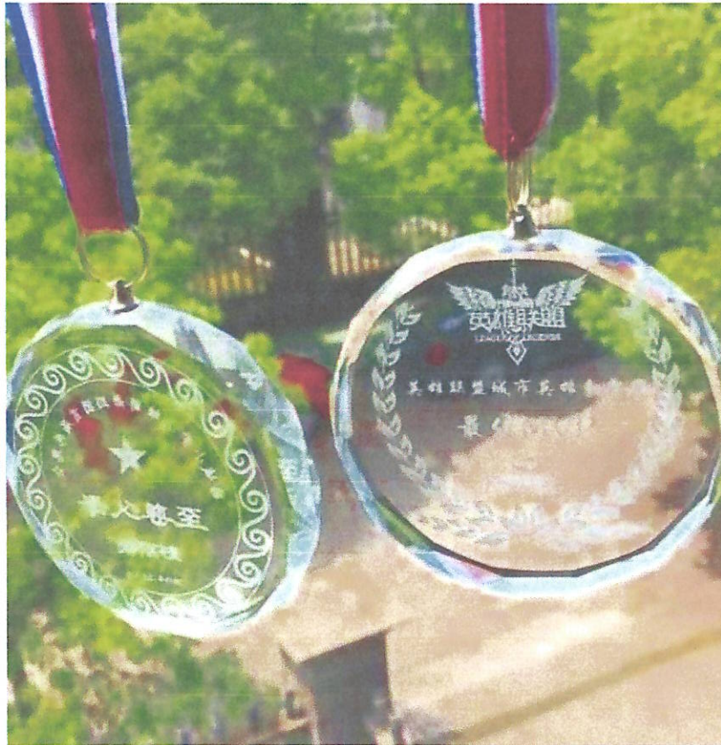
Medal Peg (Glass-based)

ATI Building, Elliptical Road, Diliman, Quezon City, Metro Manila 1100 Tel. Nos. (63-2) 8929-8541 to 49 & 8928-7397 Fax No. (63-2) 8920-9792 Email: ati_director@ati.da.gov.ph & ati_director@yahoo.com URL: http://www.ati.da.gov.ph ; www.e-extension.gov.ph