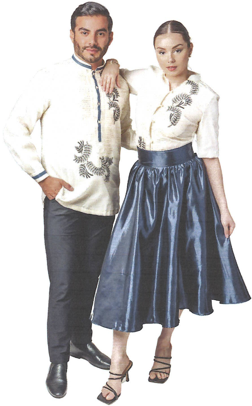
Barong tagalog (Top apparel only)