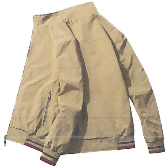
Reversible side of the jacket