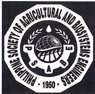
Logo as seen in Shirt